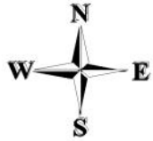
MAP 2.29- THE SWAN