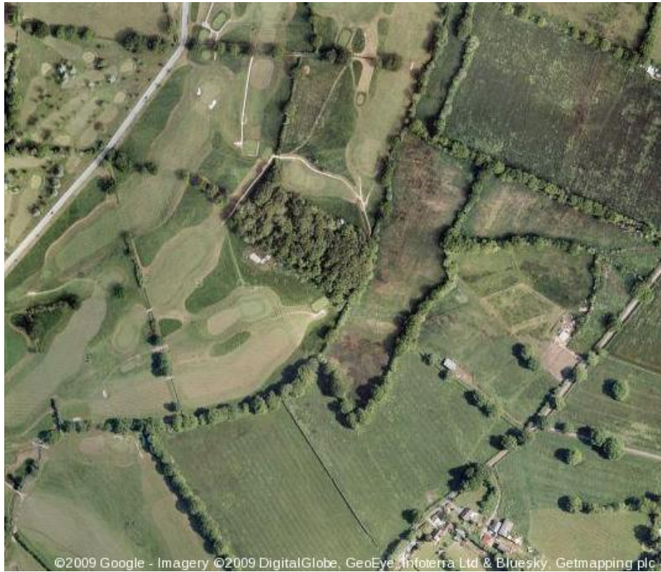
Figure 1: Durley, Hampshire, with the site of cuntan halh in the centre.