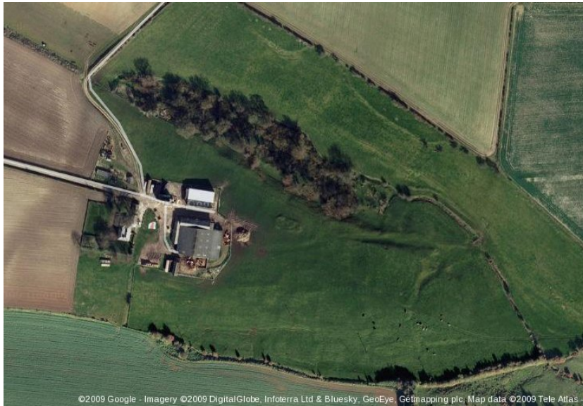
Figure 4: Cuntewellewang , Dexthorpe.

Tapcuntlathe 1393 in Penrith: (PN Cu 1: 233). Presumably from ME tap(pen) ‘touch, tap’, and hlaþa ‘barn’.