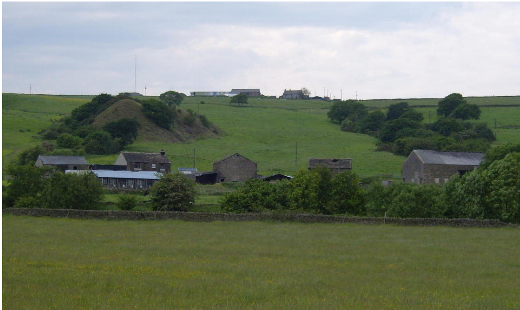
Figure 3: Lower Cunliffe (Lancashire), showing the two wooded gullies, with a spoil-heap partly obscuring the left-hand one.

Shaecuntewelle : in or near Singlewell, Kent; de Savetuntewell 1275, Shaecuntewelle 1321, last noted 1350. The name is discussed by Wallenberg (1934: 101), who does not come to a conclusion. The name may be topographical (as Cuntewelle(wang) below), or possibly it is a site of humiliating punishment of women. There is further discussion of related folkloric issues in Jones (2002: 251).