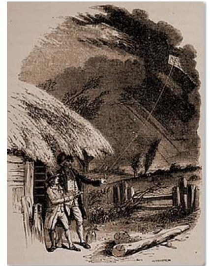
Franklin's kite experiment.

At the same time, Franklin began to gain an international reputation as a man of science, notwithstanding the fact that his formal education had come to an end at the age of 10. Franklin was endlessly curious to learn about how the physical world worked and how such knowledge could be put to use for the benefit of humankind. He undertook his best-remembered and riskiest experiment when he flew a kite in a thunderstorm, hoping to prove that lightning was a form of the then little-understood phenomenon, electricity. He went on to invent the lightening rod, a device which saved his own house from burning down when it was struck by lightning and has saved countless dwellings and lives since then. He was interested in heat and convection, and he invented an iron stove that proved a big improvement over the drafty fireplaces of the day; in fact, the "Franklin stove" is still in use today.