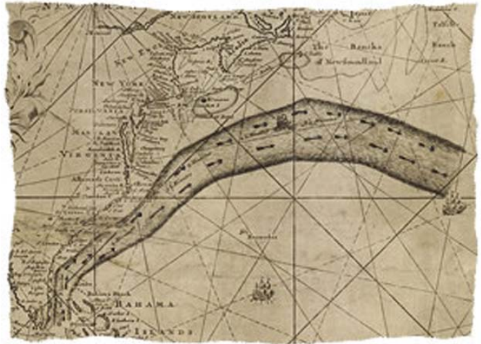
Franklin-Folger 1769 Gulf Stream chart.