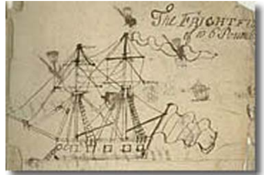
The Frightful, by John Quincy Adams.

The North Atlantic Ocean, in particular, was known for the fury of its storms, which could literally tear a boat apart and send it to the bottom. In the midst of the American Revolution, John Adams would sail from Boston to France with his 10-year old son John Quincy Adams, to join Benjamin Franklin, who was seeking French support. Though he would make relatively good time in crossing, the ship very nearly went down at sea. "We found ourselves in the Gulph Stream," John Adams would write in his diary, in one of the most furious storms, that ever Ship survived... To describe the Ocean, the Waves, the Winds, The Ship, her motions, rollings, pitches, Wringings and Agonies, The Sailors, their countenances, language and behavior, is impossible. ...no place or person was dry..." Adams recalled "vast mountains of Water above Us, and as deep caverns below Us," which "threatened to bury Us all at once in the deep." Had the ship gone down, two future presidents of the United States, John Adams, and John Quincy Adams, would have been lost at sea.