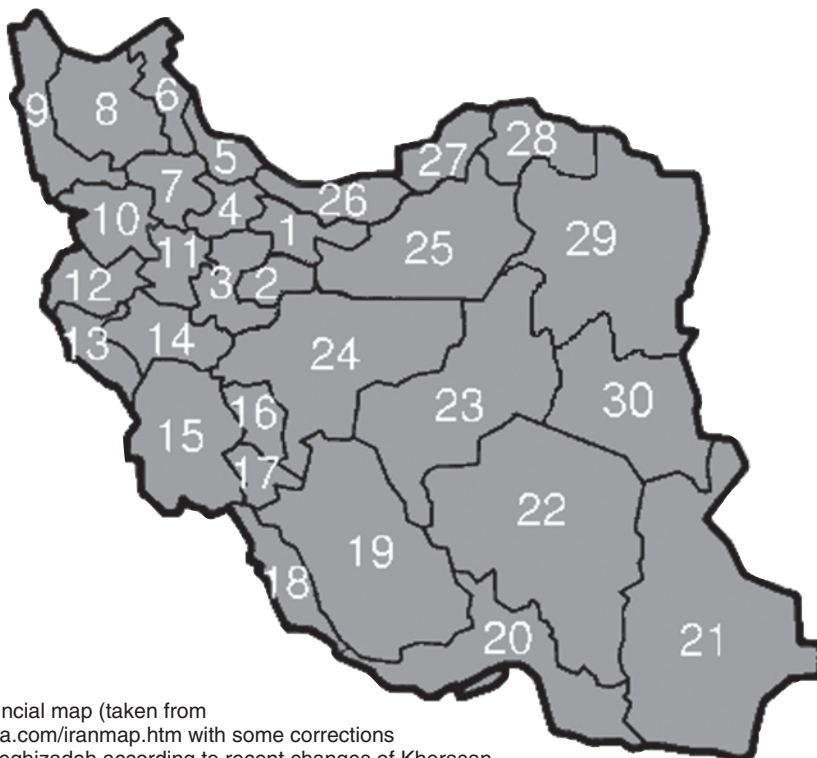
Figure 1. Iran's provincial map (taken from http://www.key2persia.com/iranmap.htm with some corrections by Abolghasem Khaleghizadeh according to recent changes of Khorasan Province). Numbers indicate name of provinces, respectively: 1. Tehran, 2. Qom, 3. Markazi, 4. Qazvin (Ghazvin), 5. Gilan, 6. Ardabil, 7. Zanjan, 8. East Azarbaijan, 9. West Azarbaijan, 10. Kurdistan (Kordestan), 11. Hamadan, 12. Kermanshah, 13. Ilam, 14. Luristan (or Lorestan), 15. Khuzestan, 16. Chahar Mahal & Bakhtiari, 17. Kohkiluyeh & Buyer Ahmad, 18. Bushehr, 19. Fars, 20. Hormozgan, 21. Seistan & Baluchestan, 22. Kerman, 23. Yazd, 24. Esfahan (or Isfahan), 25. Semnan, 26. Mazandaran, 27. Golestan, 28. North Khorasan, 29. Khorasan Razavi, 30. South Khorasan.

Our ornithological observations were made throughout Iran during from 2000–2005 inclusive. Some of the extensions of migrant distribution and breeding and wintering ranges we recorded are the first known for Iran; others represent extensions beyond that already reported. Table 1 lists the species recorded, their numbers, each location's geographical coordinates and Iranian province concerned, the date or period of each occurrence, the observer(s) and the distance from the previously known range (Scott et al 1975, Mansoori 2001). Areas were visited on foot, by car and sometimes by boat. We identified and studied the birds with binoculars and telescopes and we recorded the geographical coordinates via a Global Positioning System (GPS) (Etrex, Vista). The province map at Fig 1 will help orient readers unfamiliar with Iran.