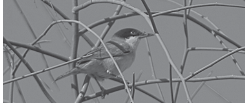
Plate 2. Orphean Warbler Sylvia [hortensis] crassirostris in Jegin woodland (SE of Iran near the town of Jask on 21 January 2005.