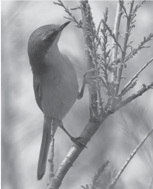
Plate 1. Lesser Whitethroat Sylvia curruca near Bazangan lake between Sarakhs and Mashad on 28 April 2005.