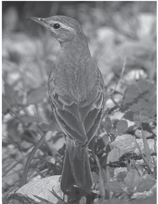
Plate 4. Long-billed Pipit Anthus similis in cultivated area near Bandar Abbas on 17 January.