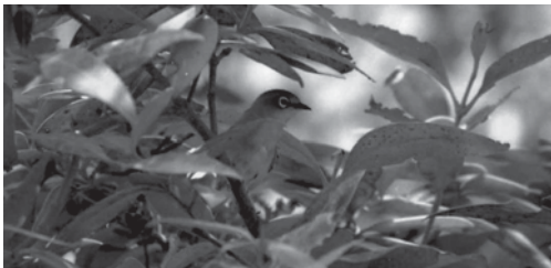
Plate 3. Two Oriental White-eye Zosterops palpebrosus observed at mangrove forest, east of Jask, July 2005.