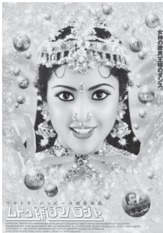
Plate 1 The leaflet of Muthu at 1998 release

In 1998, one Indian film appeared on Japanese screens. The Tamil film Muthu , which was made in Chennai (formerly Madras), the biggest city in south India, was released under the Japanese title Mutu: Odoru Maharaja (Muthu: Dancing Maharaja; Plate 1). The show