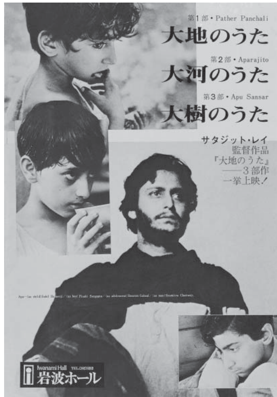
Plate 4 The catalogue of Apu trilogy ( Pather Panchali , Aparajito , and Apur Sansar ) at 1974 release

three from India. The three Indian films were the Hindi film Bhumika (The Role, 1977), directed by Shyam Benegal; the Bengali film Neem Annapurna (Bitter Morsel, 1980), by Buddhadeb Dasgupta; and the Malayalam film Kumatty (The Bogeyman, 1979), by Aravindan. This film festival attracted large audiences. Thanks to their considerable success, those films were later shown all over Japan. As the result of this film festival, Japanese people realized that Indian cinema had many excellent film directors other than Satyajit Ray. However, those three films were also art films. Accordingly, the fixed view equating Indian cinema with art films remained as unchanged as ever.