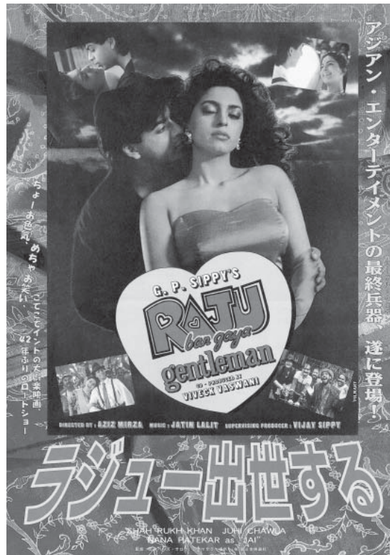
Plate 2 The leaflet of Raju Ban Gaya Gentleman at 1997 release

again, and became interested in Indian cinema.