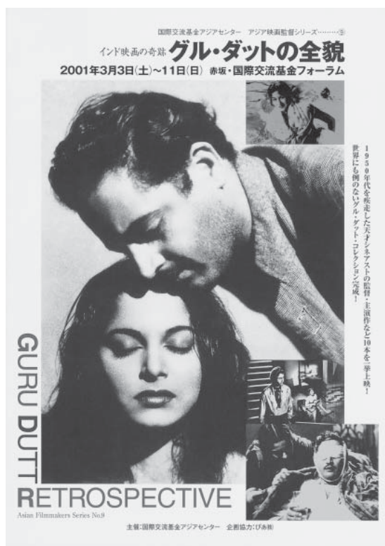
Plate 6 The leaflet of the Guru Dutt Retrospective in 2001

Fortunately, the Japan Foundation (up to 2004 its Asia Center) holds Indian film screenings as part of its film festivals as well as in the form of a retrospective every two or three years. The Japan Foundation shows a wide range of Indian films, albeit not on a commercial basis. In 1998 it organized the Indian Film Festival in Japan 1998. Six films were shown in the series entitled “The History of Indian Popular Cinema after Independence,” and six more in “Raj Kapoor and Maniratnam: Two Great Directors.” At that time, screenings outside Tokyo were rare. In 2000 and 2001, it held a Guru Dutt