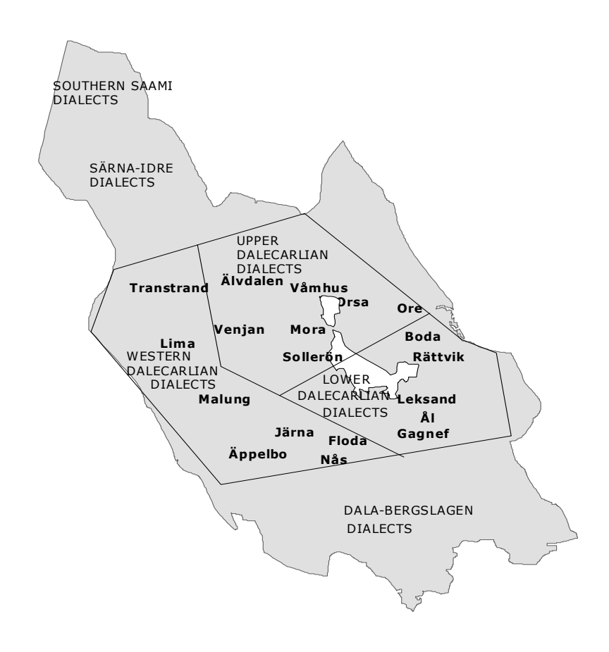
Map 2 The Linguistic Map of Dalarna<sup>1</sup>