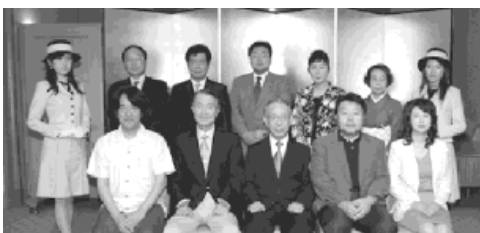
The investiture ceremony of last year