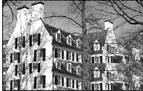
The Nittany Lion Inn in State College will be the site of the 2005 PAIFA Annual Convention and Association Leadership Conference, May 22-26.