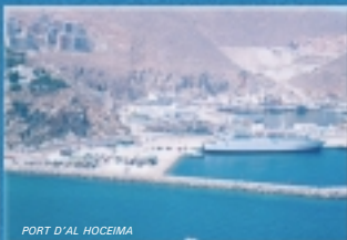
PORT D'AL HOCEIMA