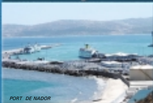
PORT DE NADOR