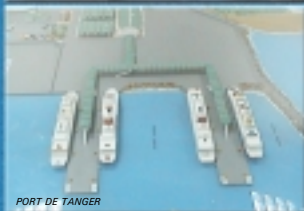
PORT DE TANGER