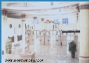
GARE MARITIME DE NADOR