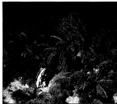
A type II error? An extensive bed of Atrina zealandica (a pinnid bivalve) (left) was decimated by commercial dredging for scallops (right).

perspective is accompanied by fewer direct human experiences (or even memories) of once undisturbed systems. The effects of humans sometimes result in cascading ecological changes—a void often in part filled with introduced or inappropriate impostors that replace and mask the traces of the former natural system—but the species often simply