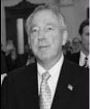
Tony Goolsby GOP State Rep (HD 102)