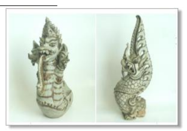
Above left: makara spewing a 3-headed naga which itself spews another naga . Right: single makara . Both Sawankhalok brown and white ware, beginning 16th century, Southeast Asian Ceramics Museum.