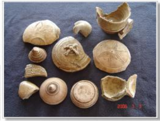
Pakaong kiln mound & kaam shards(above); new finds from Anlong Thom