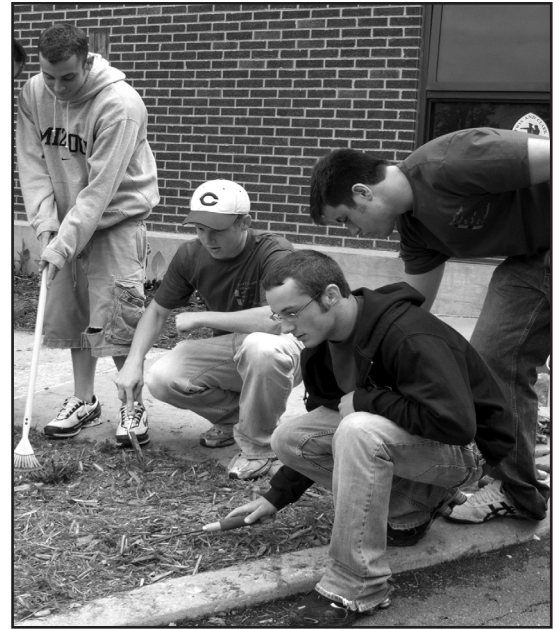
Central High School Seniors begin the process of spreading mulch in the flower gardens on the Museum grounds.

Eighteen Central High School seniors volunteered to spruce up the grounds at the St. Joseph Museums, Inc., Frederick Avenue site during Senior Service Day. The landscaping projects included spreading cedar mulch, planting flowers, and weeding the many flower beds on the property. This work was the first step in preparing the grounds for the butterfly garden/outdoor classroom, which was made possible by a grant from the Missouri Department of Conservation. The butterfly garden will open on July 29.