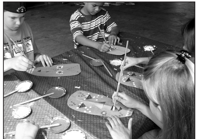
Youngsters created African masks during the African textile workshop at the Bartlett Center

The Black Archives Museum, of the St. Joseph Museums, Inc., presented an African Textile Printing workshop at the Bartlett Center on June 12 and 13 for youth of all ages. The textile workshop was part of a series of activities during the local celebration of Juneteenth. Over forty children participated in the afternoons activities, which included learning the art of traditional African textile printing using gourds and flower/paste indigo resist.