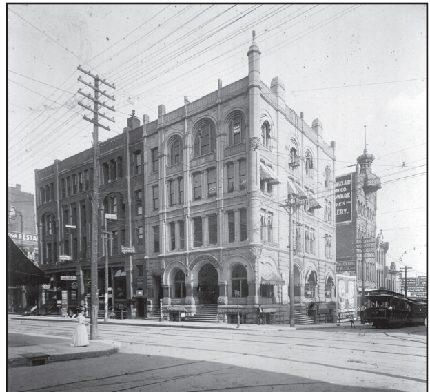
Above: Commercial Block Building at 203 South 6th Street.