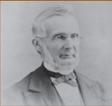
Arnold Henry Guyot

“That man was made last of all of the creatures was both an honor and a favor to him – an honor, for the method of the creation was to advance from that which was less perfect to that which was more so, and a favor, for it was not fit that he should be lodged in the palace designed for him, until it was completely fitted and furnished for his reception.”