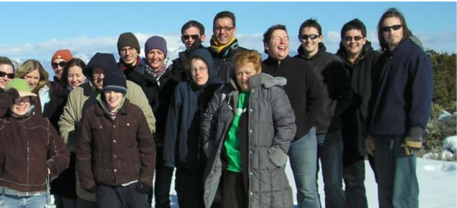
ys that warm