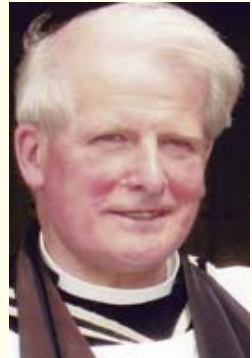
A tribute to Rev Garner - P2