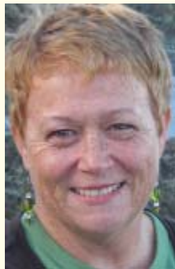
Building a gospel bridge - P10