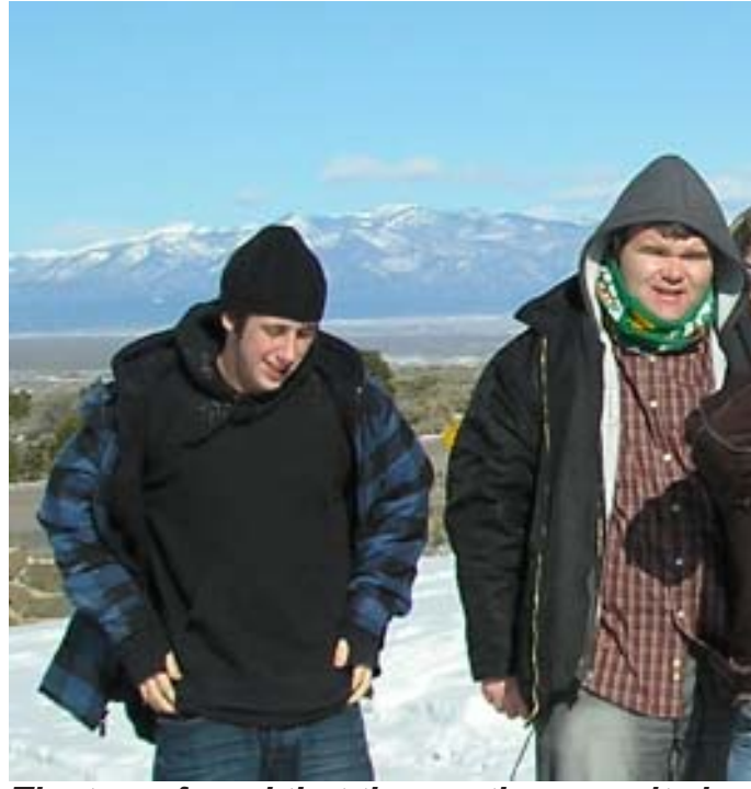
The team found that the weather wasn't always what they expected