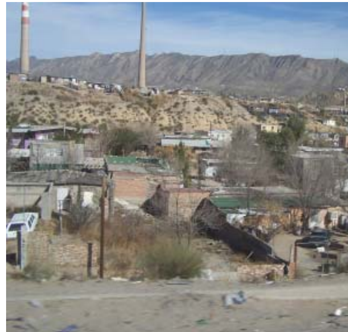
Most people in Juarez live in extremely basic conditions

December 27, 2007, and Dublin Airport is awash with excited jet-setters queuing for check in, weighing of bags, passing through security ... and some disposing of toothpaste that just isn't allowed on flights any more!