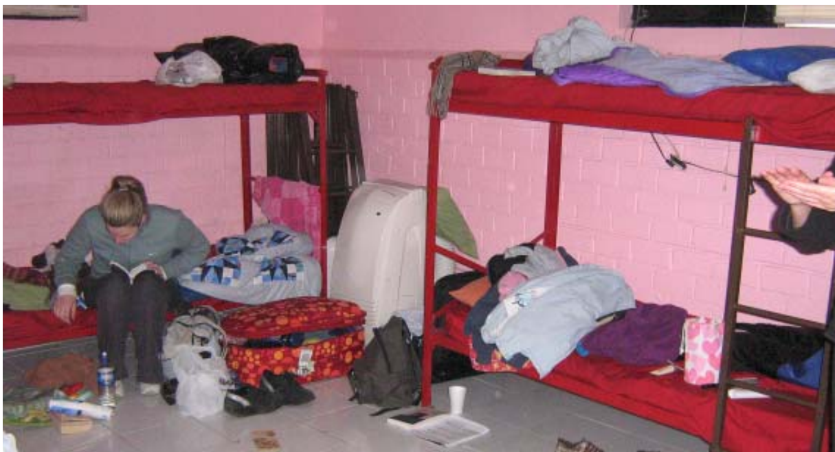
The team settle into bunks during their stay

a number of years Gateway have been hosting teams in the second fastest growing city in Mexico. The Mission have a compound there that accommodates the teams for their duration in Juarez.