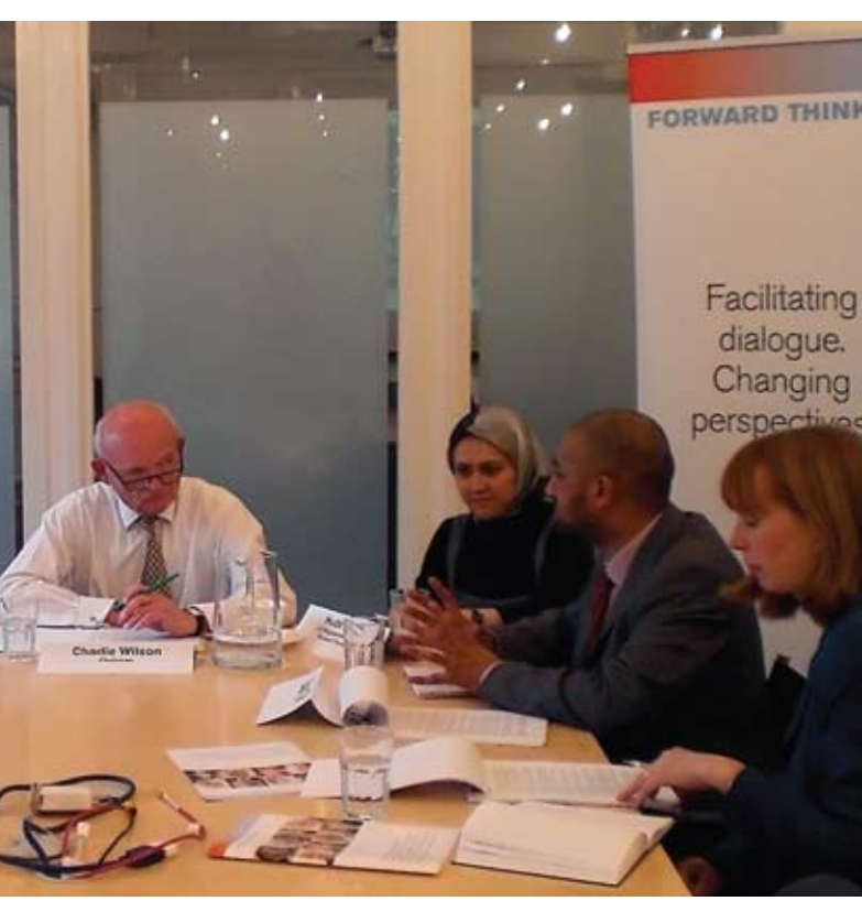
Forward Thinking's report; Forgotten Voices: Developing more effective engagement with Muslim youth & communities

Forward Thinking has continued its increased involvement in advising and briefing the media, particularly on issues related to government policy towards tackling extremism and radicalisation as well as the impact of anti-terror legislation on Muslim communities. As in past years, every effort is made to ensure that grassroots voices with a real