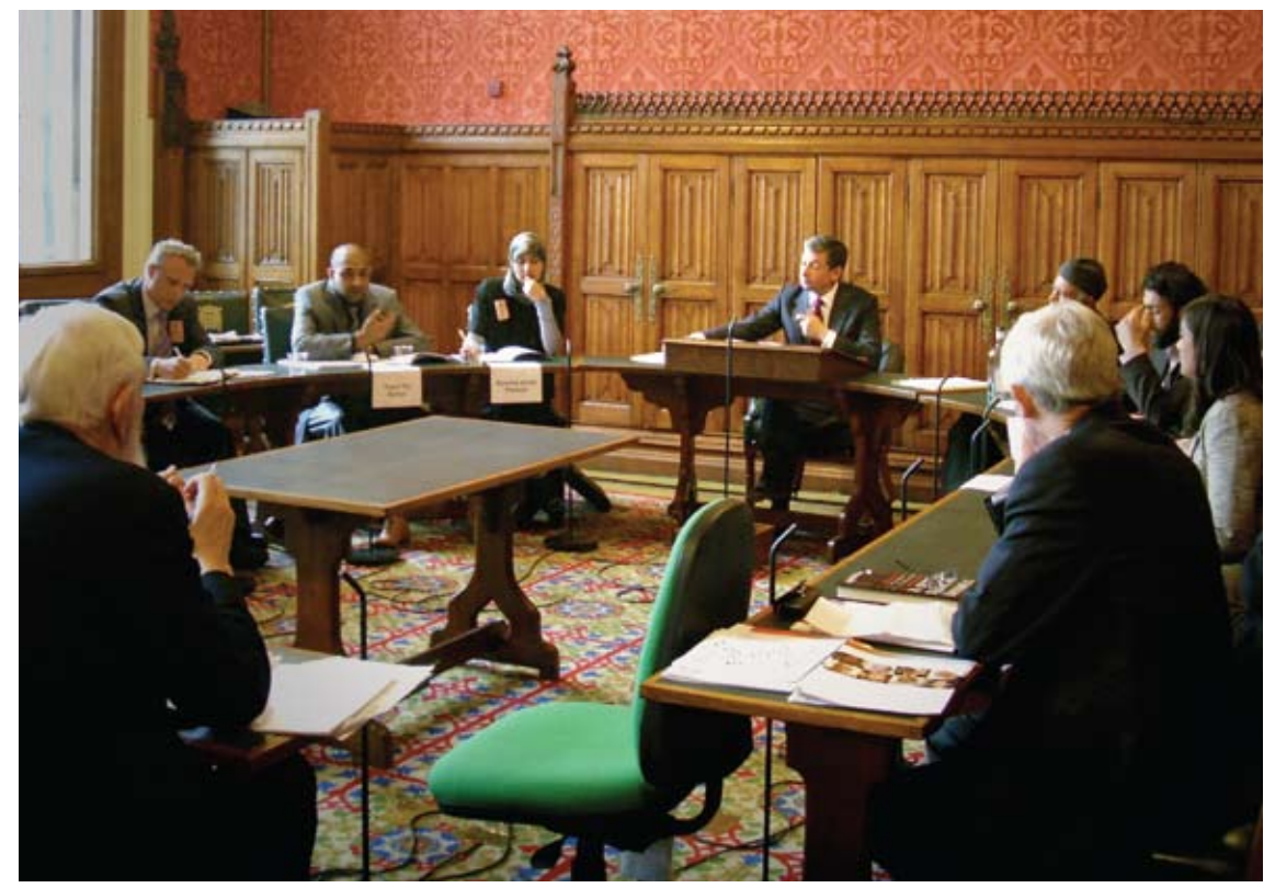
Youth Identity seminar at The House of Commons