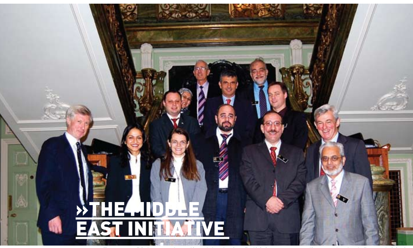
European Diplomats, Israeli and Jordanian Politicians meet to discuss the Arab Peace Initiative

The Middle East Initiative is based on the belief that a durable peace agreement to end the Israeli-Palestinian conflict can only be achieved through the active participation of those who are regarded as political or religious hardliners. Over the past year, we sought to engage in – and promote – an inclusive dialogue with a variety of Israeli and Palestinian partners, as well as with opinionshapers and key figures in neighbouring Middle East and EU countries. Our priorities over the year were to: