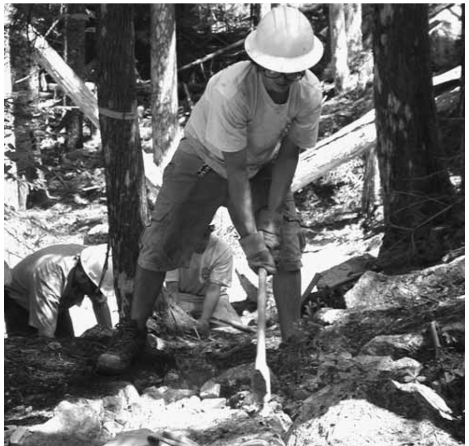
Crushing rock for trail base layer on the Maple Spring Trail.