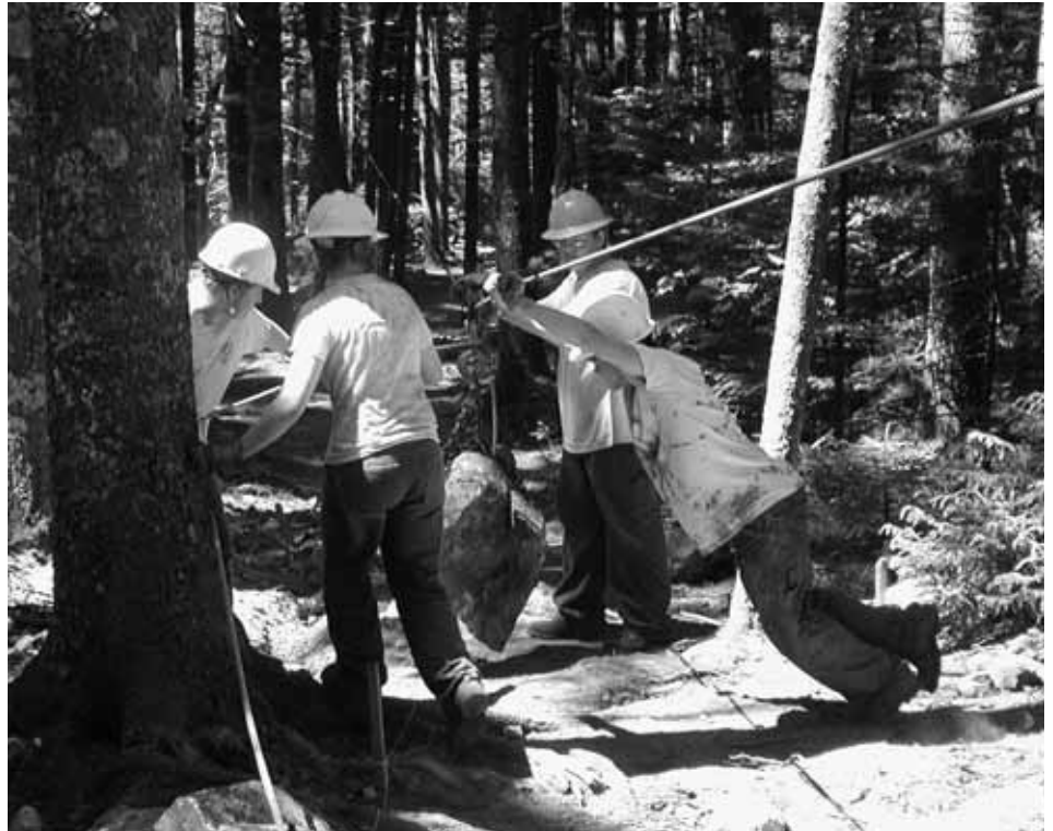
Moving rock with a high line on the Pond Trail.

Before we close the book on this season, Friends would like to say thank you to the