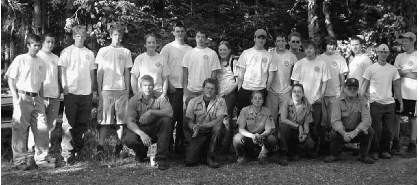
Acadia Youth Conservation Corps 2005.

long-time benefactors who make this program possible. And we take our hats off to the teens who were the 2005 Acadia Youth Conservation Corps—your work will endure beyond your expectations. ♣