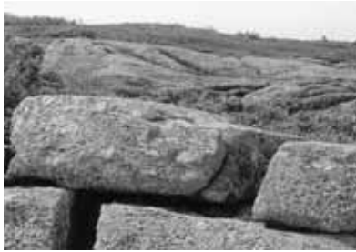
Sargent Mountain Summit