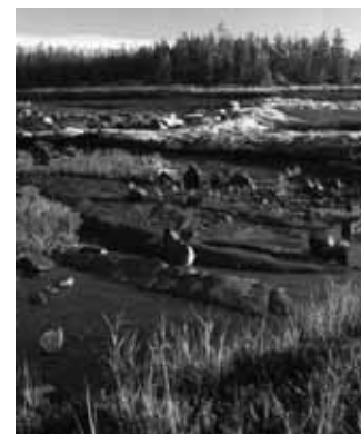
Low Tide at Wonderland