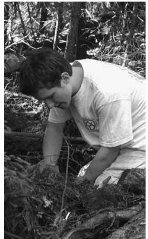
Removing vegetation from drainage along the Deer Brook Trail.