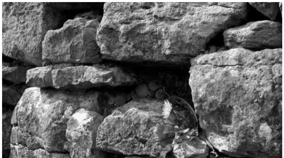
Rocks at Schoodic