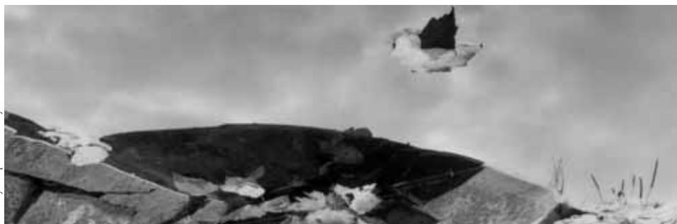
Rock Pool and Reflections