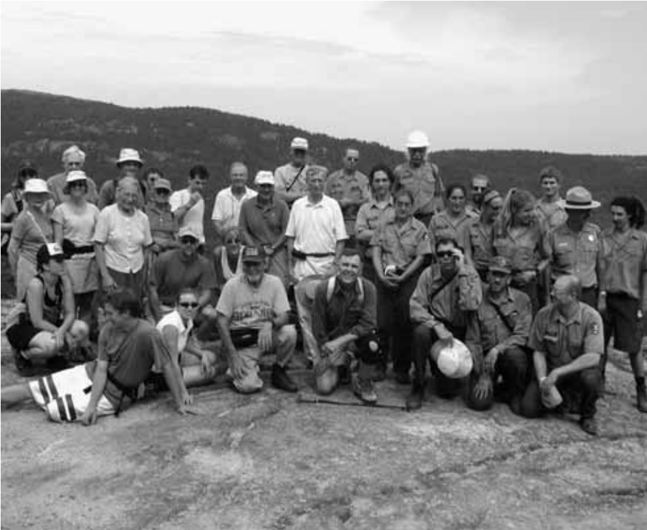
Acadia National Park staff and Friends of Acadia members and staff on the way up to the restored Penobscot Mtn. Trail.

was signed with its historic name: Sargent East Cliffs.