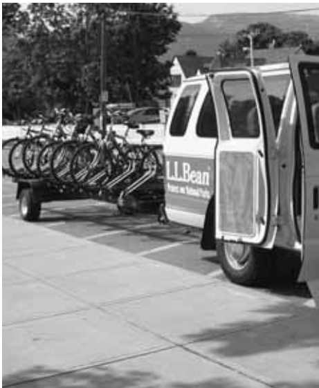
The Island Explorer Bicycle Express.

For the first time this summer, bicyclists had another option for returning to Bar Harbor after feasting on popovers at the Jordan Pond House. In addition to regular Island Explorer service, Downeast Transportation initiated a bike shuttle featuring non-stop trips between Bar Harbor and Jordan Pond through the end of August.