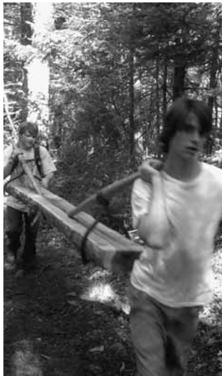
Hauling bog walk planks on the Giant Slide Trail.