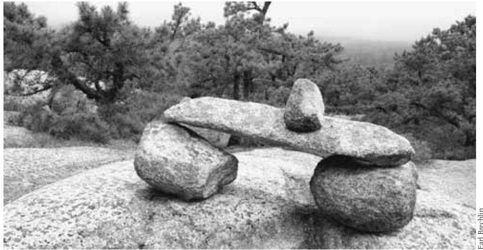
A Bates cairn on the Champlain Mountain Bear Brook Trail.

Long before Acadia adopted the familiar conical shape for cairns, trail pathfinder Waldron Bates, who laid out many of the paths on the island's eastern side, specified a unique marking system. It consisted of a pair of large base stones spaced a foot or two apart and spanned horizontally by a narrow, flat stone, not unlike a small table. In the center of the flat stone an oblong "indica-