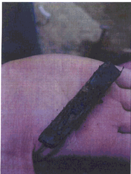
Above – pipe stem from the Australian trench Right – remains of a German gas mask