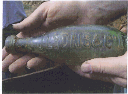
Lyons (above) and HP Sauce (below) bottles from an Australian trench

Although some aspects such as digging through obliterated front line trenches to form a new front line must have been a very new experience, the training on Salisbury Plain had certainly been effective. Men knew their roles and were able to perform a textbook turning-round of a captured enemy front line including the fortification of 'Ultimo' crater. Such attention to detail was an important part of ensuring that the battle of Messines was such a huge success. Furthermore it highlights the fact that commanding officers could learn the lessons of previous, unsuccessful, campaigns and that the allied forces were not simply 'lions led by donkeys'