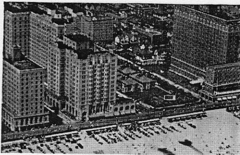
Ambassador Hotel—IMSA Convention Headquarters—in center.

Make "Meet me on the Boardwalk" your Convention Slogan for '54.