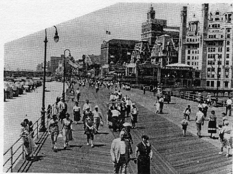
Strolling & chair riding along famous Atlantic City Boardwalk. It is six miles long.

Atlantic City Scenes sure to stimulate IMSA Conventioneers.