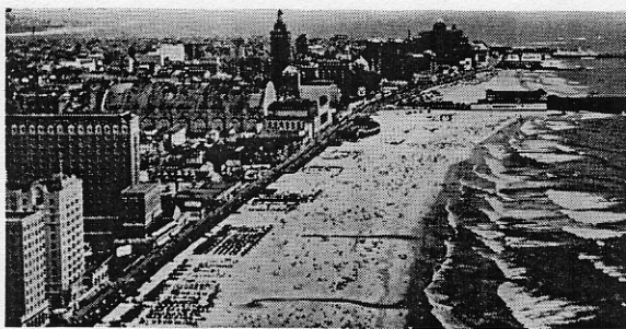
View of beach & boardwalk at Atlantic City—scene of IMSA Convention, October 4-5-6-7.

Atlantic City Scenes sure to stimulate IMSA Conventioneers.