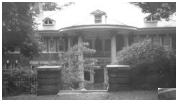
THE JUNIOR LEAGUE OF MONTCLAIR-NEWARK GEORGIAN HEIGHTS SHOWHOUSE & GARDENS

G eorgian Heights boasts 28 rooms, a carriage house, stunning panoramic views of the