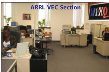
ARRL VEC Section