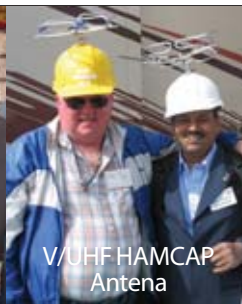
V/UHF HAMCAP Antenna