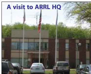
A visit to ARRL HQ