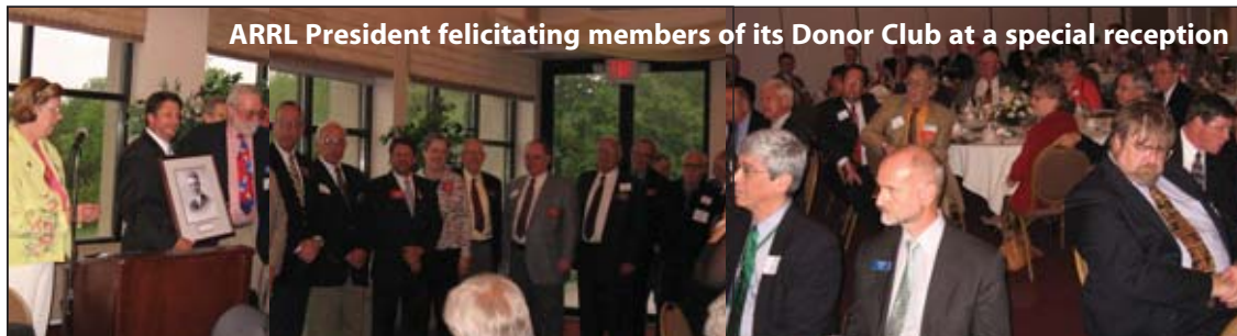
ARRL President felicitating members of its Donor Club at a special reception