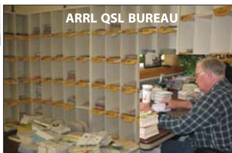
ARRL QSL BUREAU