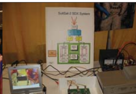
TruStar 2 SBCX Systems