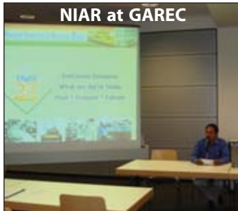
NIAR at GAREC