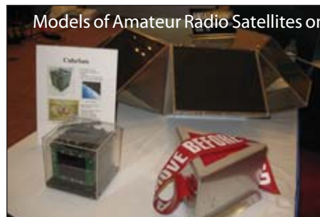
Models of Amateur Radio Satellites on Display