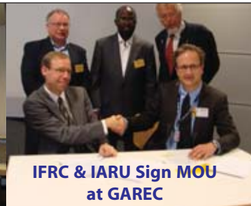
IFRC & IARU Sign MOU at GAREC