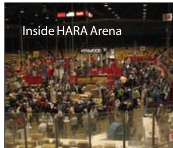
Inside HARA Arena