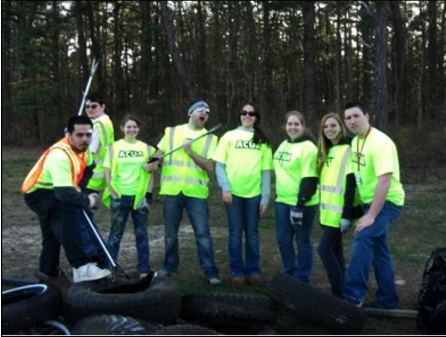
Stockton and Rowan members joined forces to clean up the roads through the Adopt-A-Road program