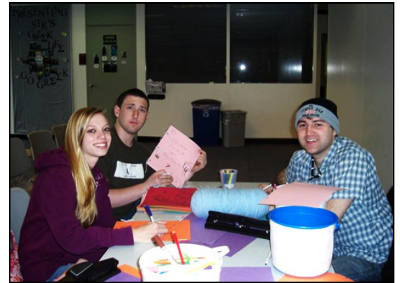
Putting together coloring books for children

In fact, Service-A-Thon is such a compelling project that Stockton is going to hold the event every semester, rather than just annually. It's a chance to boost service hours and assure the community of Stockton's commitment to service. ■