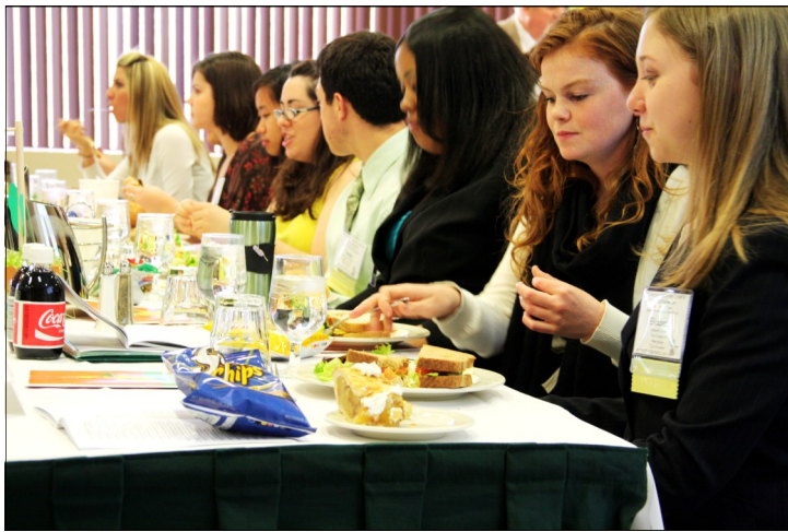
2009-'10 NJCKI Presidents enjoy their sandwiches and drinks at the President's Luncheon