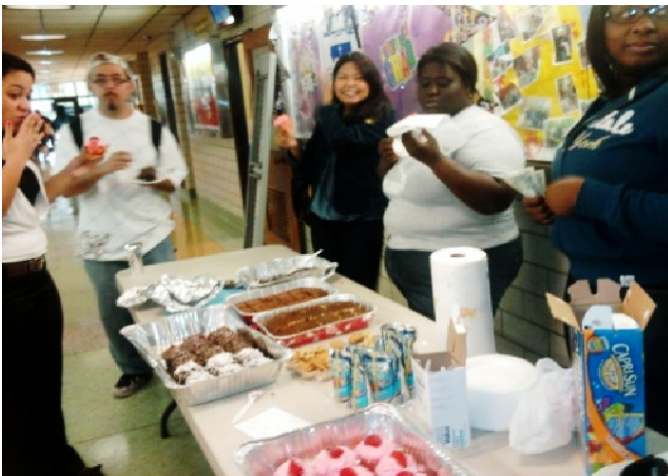
BY KATHYA ANDRE ST. PETER'S COLLEGE

The smell of brownies, cookies and cupcakes filled the halls of Saint Peter's College as Circle K members had its bake sale on April 14, 2010. Armed with trays of tasty treats, Circle K members satisfied the sweet tooth of countless SPC students (including themselves) and some faculty and staff members as well. The fundraiser was aimed at raising money for various upcoming Circle K events. We were relieved when we broke even, glad when we made a little profit, ecstatic when we beat our last bake sale record, and overjoyed when we counted our profits as the bake sale ended- a whopping $76 in just an hour! ■