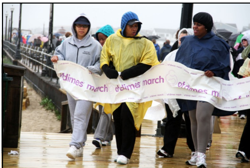
Walkers at the Monmouth March of Babies