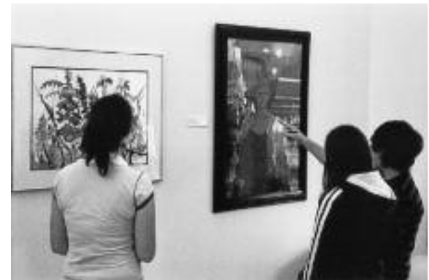
High school students examine works during a tour of the Southwestern Pennsylvania Council on the Arts' 12th Annual Regional Juried Exhibition at SAMA-Ligonier Valley.