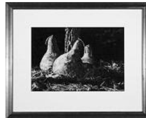
Judith Cutler Morning Sun on Gourds , 2002