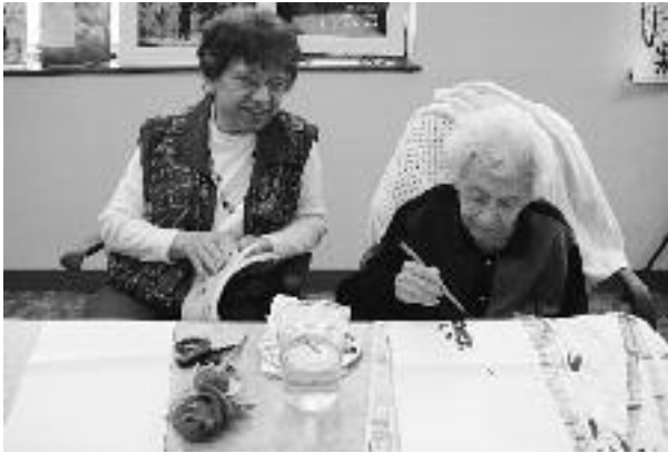
A patient creates a watercolor painting through the Arts for Healing program.