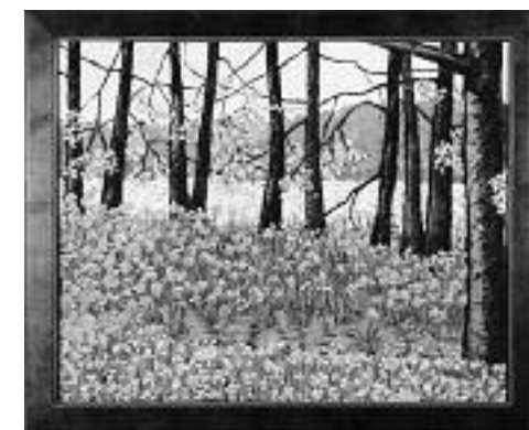
Ralph Welsh III Beside My Studio #15 , 2007