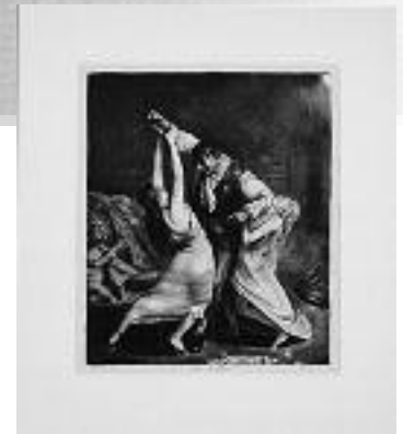
George Wesley Bellows The Drunk (Second Stone) , 1923-24