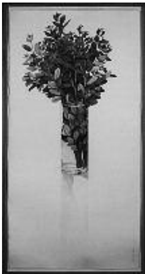
Gary Bukovnik Harmony in Blue and Green , 1985

Samibel , 2004 Pastel on paper, 14" x 19" Gift of the artist