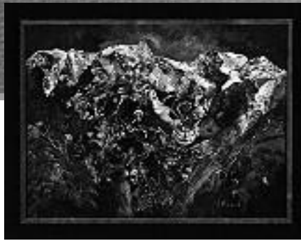
Judith Counsel Vipond Choices , 2003