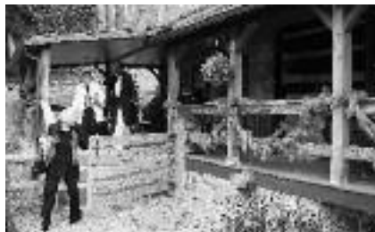
Guests visit one of the stops along SAMA-Ligonier Valley's annual Holiday Home Tour.