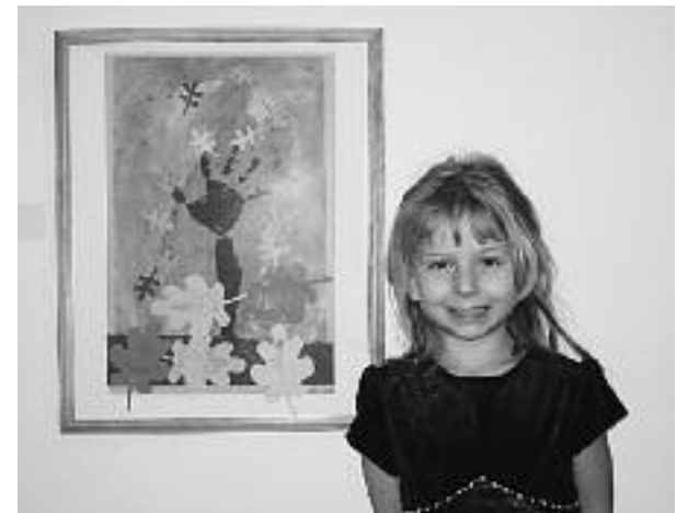
A young artist poses with her artwork at the opening reception for SAMA-Ligonier Valley's Artists of the 21st Century .