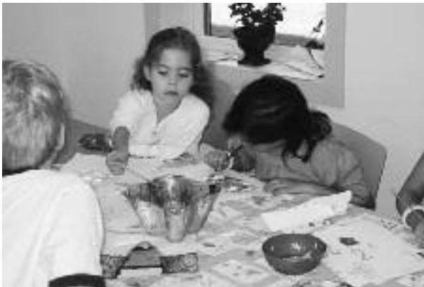
Children work on designs for puppets they will create through SAMA-Ligonier Valley's art camp.

Every year, the Southern Alleghenies Museum of Art puts an emphasis on its education programs. From in-school Arts-in-Education programs to in-museum endeavors such as the Artists of the 21st Century student art exhibition, the Museum is able to reach approximately 10,000 students throughout Bedford, Blair, Cambria, Fayette, Somerset and Westmoreland counties.