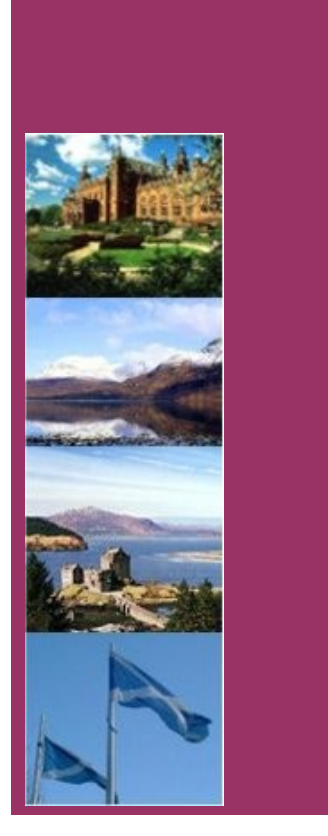
BNP Scotland Manifesto

Our society will be one that recognises the value of all its subjects. Rude and uncivil behaviour carried out by individuals against people who look and behave differently from the perceived norm, is just that; rude and uncivil. All citizens must be equal before the law. The present regime which grants greater protection for any minority breeds discontent and utterly contradicts the moral fundamental of equality before the law.