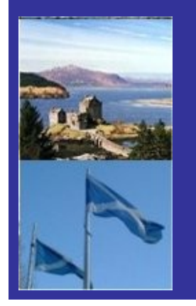
BNP Scotland Manifesto