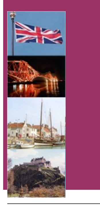
BNP Scotland Manifesto

BNP Scotland would actively encourage the development of living participation spectacles, historical re-enactment and pageants. Scotland is part of the western European family of nations and public sponsorship of the Arts in general must reflect that family association.