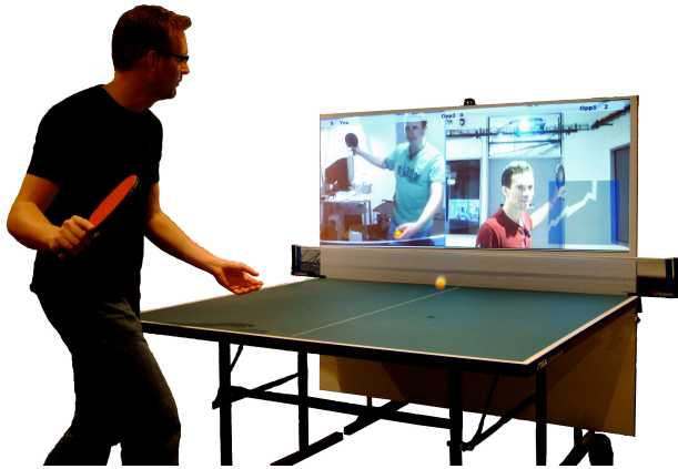
Fig. 1. Table Tennis for Three.

We begin by briefly describing the gameplay of Table Tennis for Three, a tangible game that uses a real ball, bat and table but supports players in three geographically distant locations. For a detailed description and implementation details see [28].