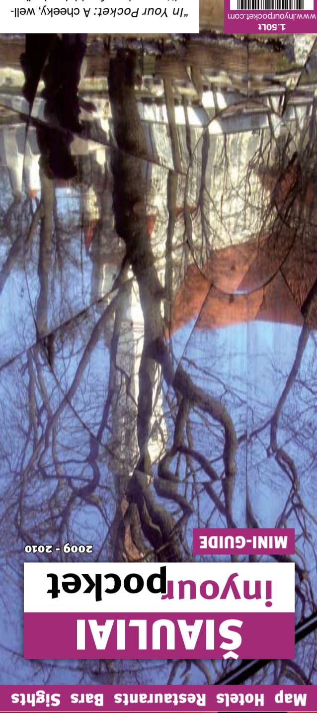
Map Hotels Restaurants Bars Sights

The New York Times... In Your Pocket: A cheeky, well-written series of guidesbooks.