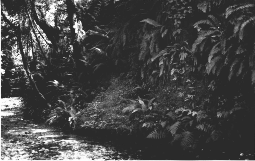
FIG. 6. Habitat of E. pardella in Northern California.

imum in this area because of off shore upwelling. They indicated that the mean monthly air temperature normally changes only a few degrees between the coldest and warmest months, and the ocean temperature changes very little.