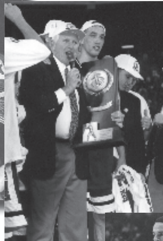
Lute Olson and the Arizona Wildcats captured the 1997 NCAA title.