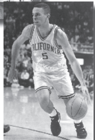
Jason Kidd, California