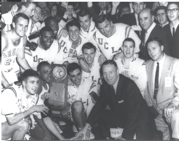
The 1964 UCLA Bruins, the first of the school's 11 NCAA Championship squads.