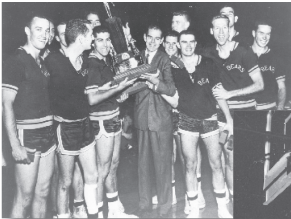
Pete Newell and his California Golden Bears celebrate the 1959 NCAA title.