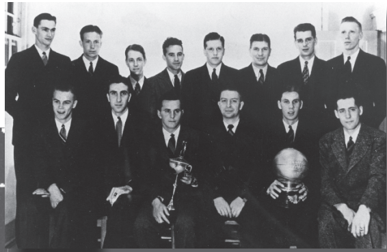
Oregon's "Tall Firs" won the first NCAA title in 1939.