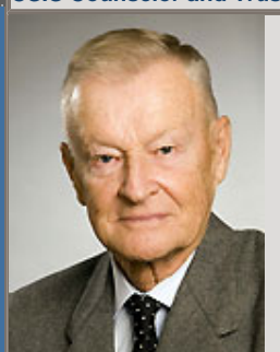
List of Publications»