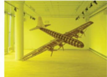
Taro Hattori Till That Morning Black Square Gallery, Miami

For more information on special exhibitions and exhibitor lists, please visit our website at www.mia-artfair.com .