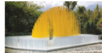
Jesús Rafael Soto Ascaso Gallery, Miami & Caracas