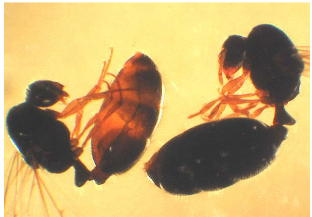
Fig. 2: Solenopsis fugax gynes in translucent light. Left: a healthy specimen. The crop is shining, filled with an oily substance. Right: the somewhat enlarged gaster appears black, filled with numerous Myrmecinosporidium spores.