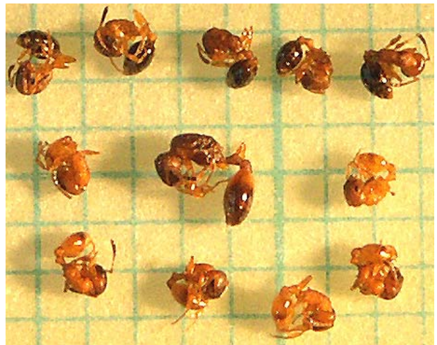
Fig. 1: Queen (center) and workers of Temnothorax albipennis (= T. tuberointerruptus ) from one of the recently detected colonies in the Italian Abruzzo. The workers in the upper line have the characteristic black gasters, all other specimens are healthy.

Fungus-infected workers did not show any detectable aberrance in their behavior. They did not clus-