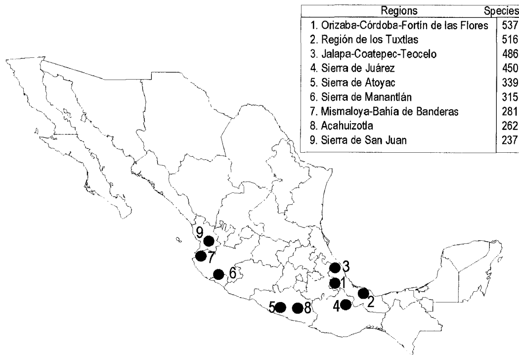
Map 2. Numbers of Papilionoidea species known from Mexico's most diverse regions. Each region includes from three to more than 30 separate collecting sites.

montane forests (especially the montane cloud forests) of central and southern Mexico. The insular distribution of the montane cloud forests along various mountain chains in Mexico has resulted in the speciation of many taxa, a phenomenon evident in many plant and animal groups (Halffter 1987). According to Llorente (1984), there are two altitudinal barriers in Mexico which limit dispersion and generally prohibit continuous distributions of taxa: one around 600 m, and the other around 2,000 m. Each of these altitudinal barriers present dramatically different climatic and vegetational conditions. Throughout Mesoamerica, the lower altitudinal zone is composed of the tropical evergreen and semi-deciduous forests on the Atlantic slope, with tropical deciduous and semi-deciduous forests on the Pacific slope. The middle elevational zone (roughly 600–