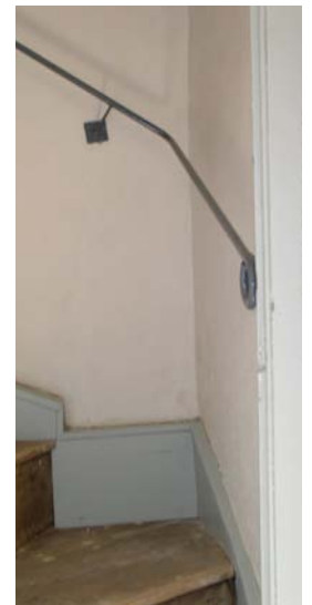
6 Repair and conversion of an 18 th c chapel to form village community accommodation.

Complex, conservative repair and conversion project under Heritage Lottery Fund and English Heritage grant aid. The roof was failing and the trusses and central column had to be reinforced.