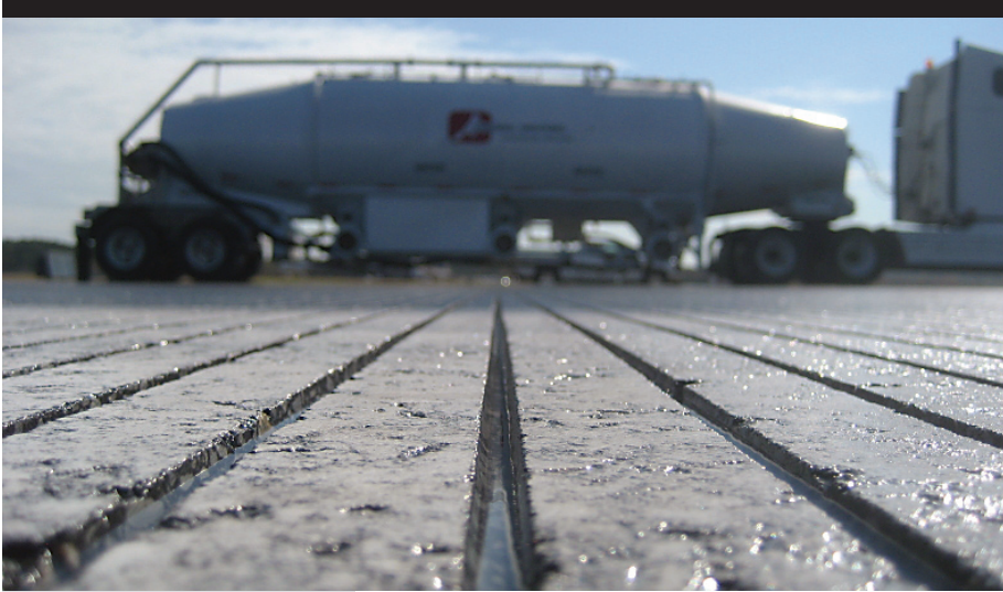
Grooved runway surface ↗