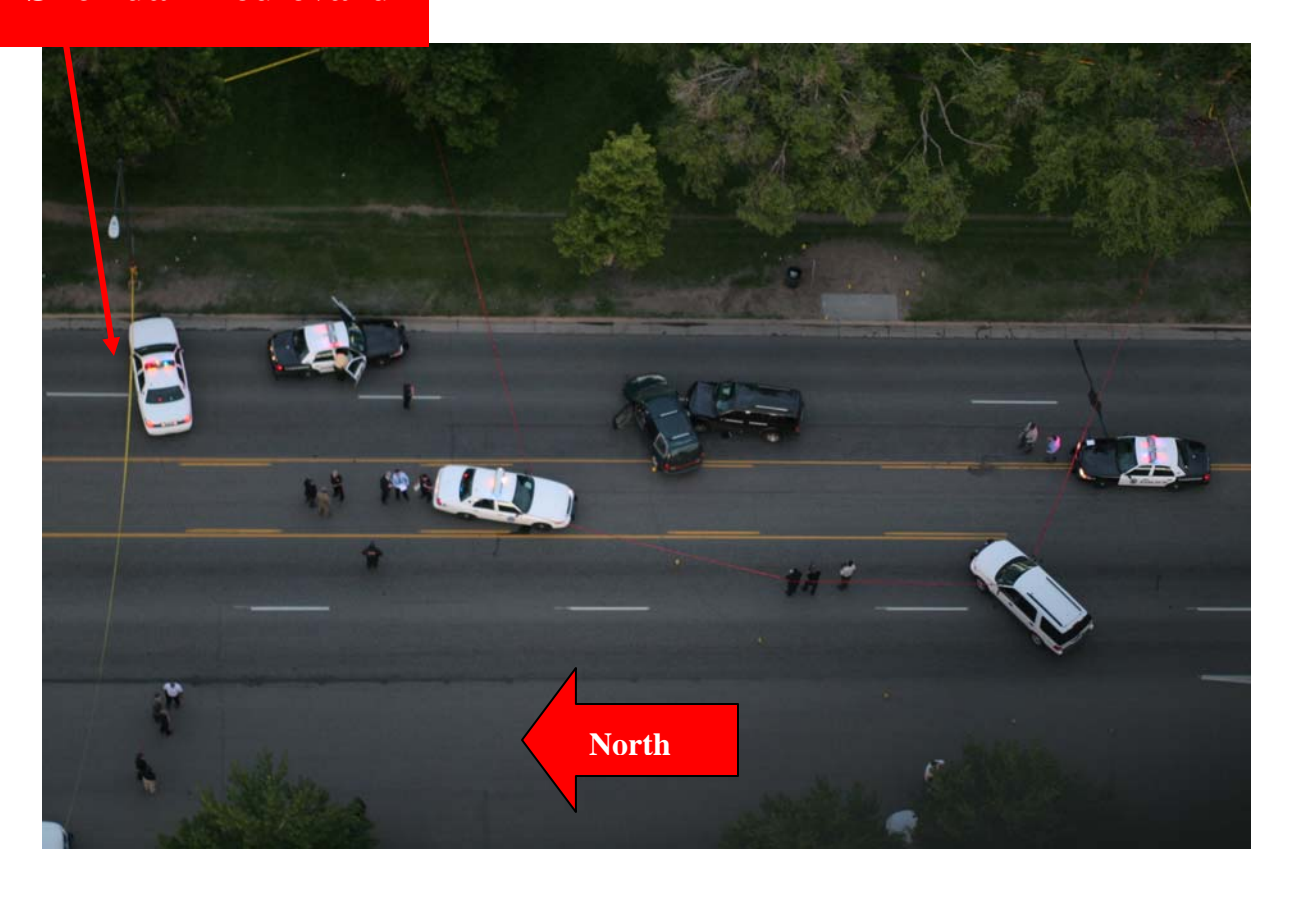
Officer-Involved Shooting June 10, 2009