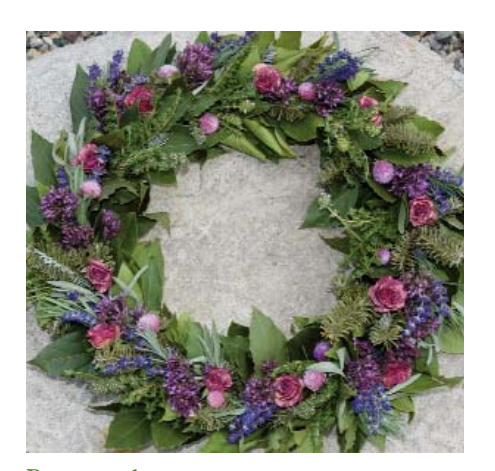
Bay wreath

She has been an active member of The Herb Society of America for 24 years and is currently serving as Education Chair for The Society.