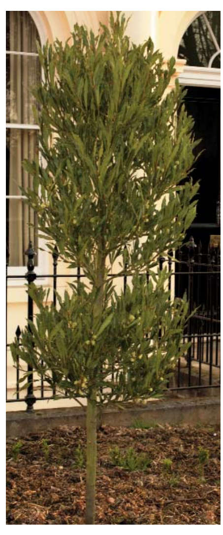
Laurus nobilis 'Angustifolia'