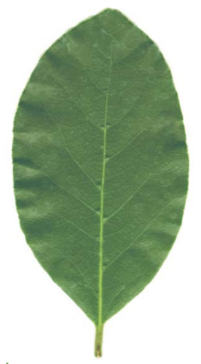
L. azorica

Flowers: Flowers are dioecious, greenish-yellow in axillary clusters. Fruits/Seeds: Fruit is glossy black and olive-like, 10 to 15 mm round.