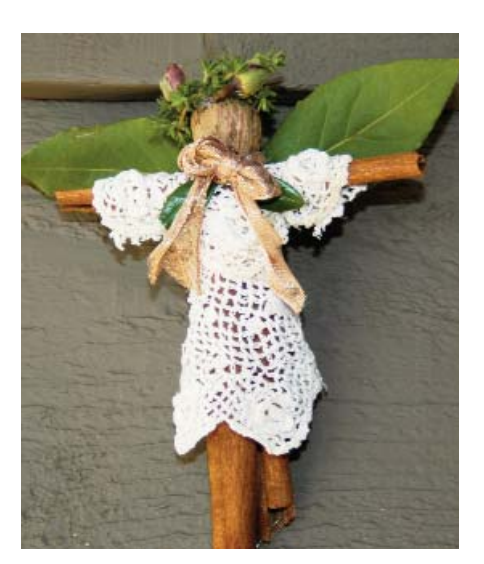
Bay angel ornament