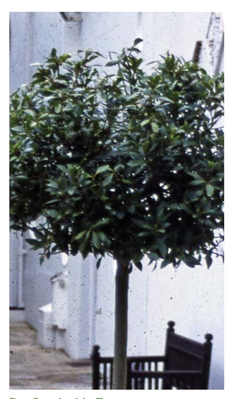
Bay Standard in France

Sweep Herb Farm; the original 4.25 acres has now grown to 120 acres. They collect and create new varieties of herbs and have extensive gardens that display the many varieties of herbs at the farm. Lecturing and teaching craft classes are an important part of every season. Three grown children and five grandchildren along with a barnyard full of animals are all part of her life.