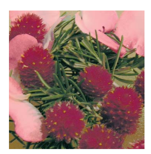
Roses, rosemary, globe amaranth