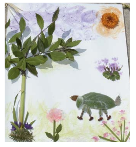
Bay leaves and flower juice picture. Flower juice and flowers are non-toxic.