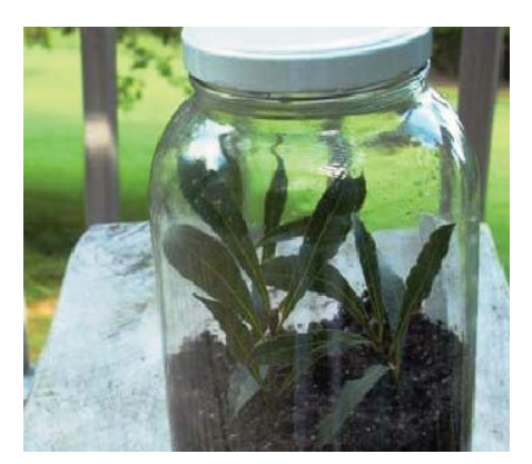
Rooting cuttings of bay

about an inch and a half above the bottom of the jar. Insert the cuttings, leaving space between each one and gently firm the soilless mix. If you use the liquid hormone it is not necessary to make a hole before inserting. Place the lid on the jar and put it in a cool room in the house with indirect light. Check several times during the winter to see if the soil is moist and if there are any signs of fungal growth. Resist giving little tugs to see if roots are forming.