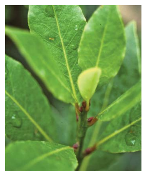
Laurus nobilis

Information is provided as an educational service. Mention of commercial products does not indicate an endorsement by The Herb Society of America. The Herb Society of America cannot advise, recommend, or prescribe herbs for medicinal use. Please consult a health care provider before pursuing any herbal treatments.