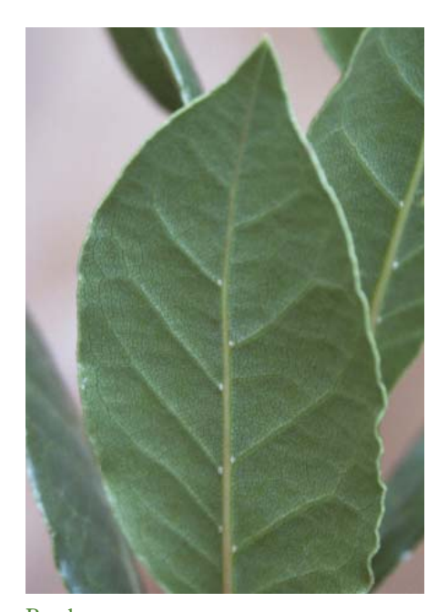
Bay leaves

If the icing is too thin, add a bit more sugar; if it is too thick, add a little more lemon juice.