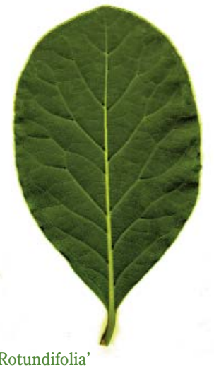
L. n. 'Rotundifolia'