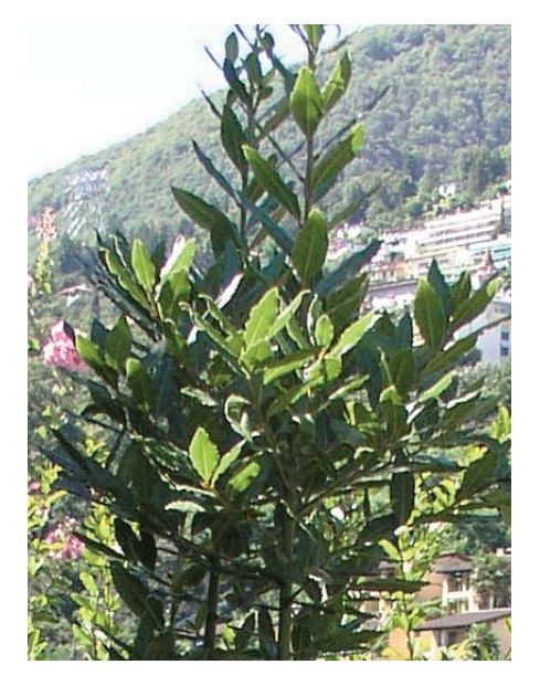
Laurus nobilis, Muralto, Switzerland

'Elliptica,' 'Ellipticifolia,' 'Floribunda,' 'Iterophylla,' 'Lanceolata,' 'Longifolia,' 'Minor,' 'Mustacen,' 'Obscura,' 'Pompeiana,' 'Pyriformis,' 'Regia,' 'Rotundifolia,' 'Rubrinercis,' 'Subovata,' 'Sylvatica,' and 'Triumphalis.'