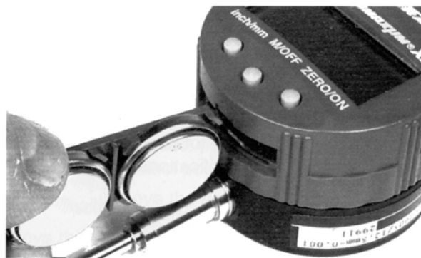
Figure 6-2c Changing the Battery