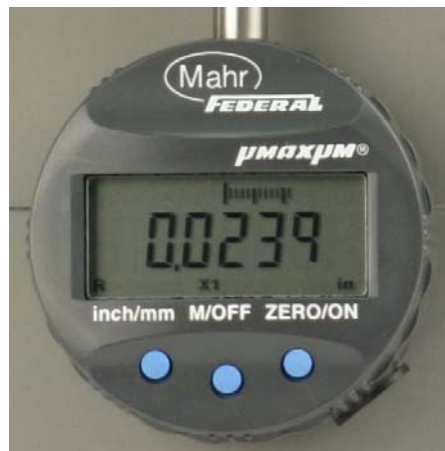
Figure 2: Indicator Face

For additional information on the use of the SPC Data Port output, see the Electronics Inc. TSP-3_output_connector_data.pdf .