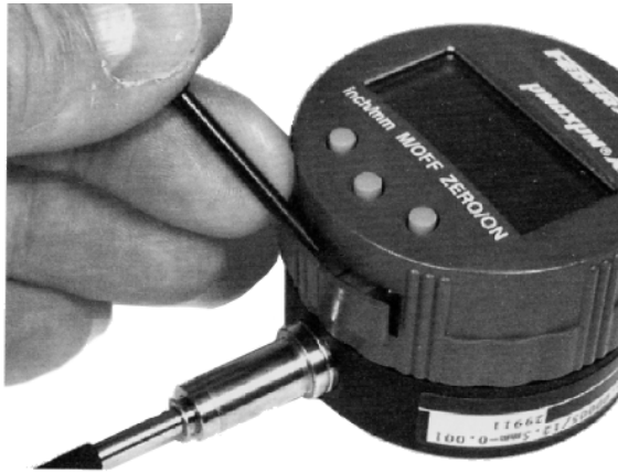
Figure 6-2a Changing The battery