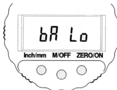
Figure 6-1 Battery Low Indication

A. A battery low is indicated when the indicator displays “bALo” . The indicator will not function until new batteries (2) are installed. Use (2) CR2450 cells.