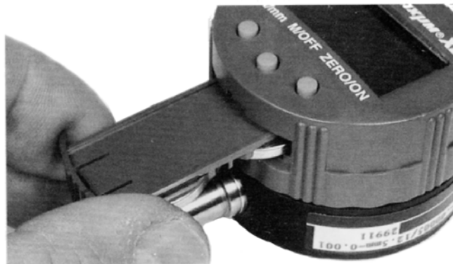
Figure 6-2b Changing the Battery