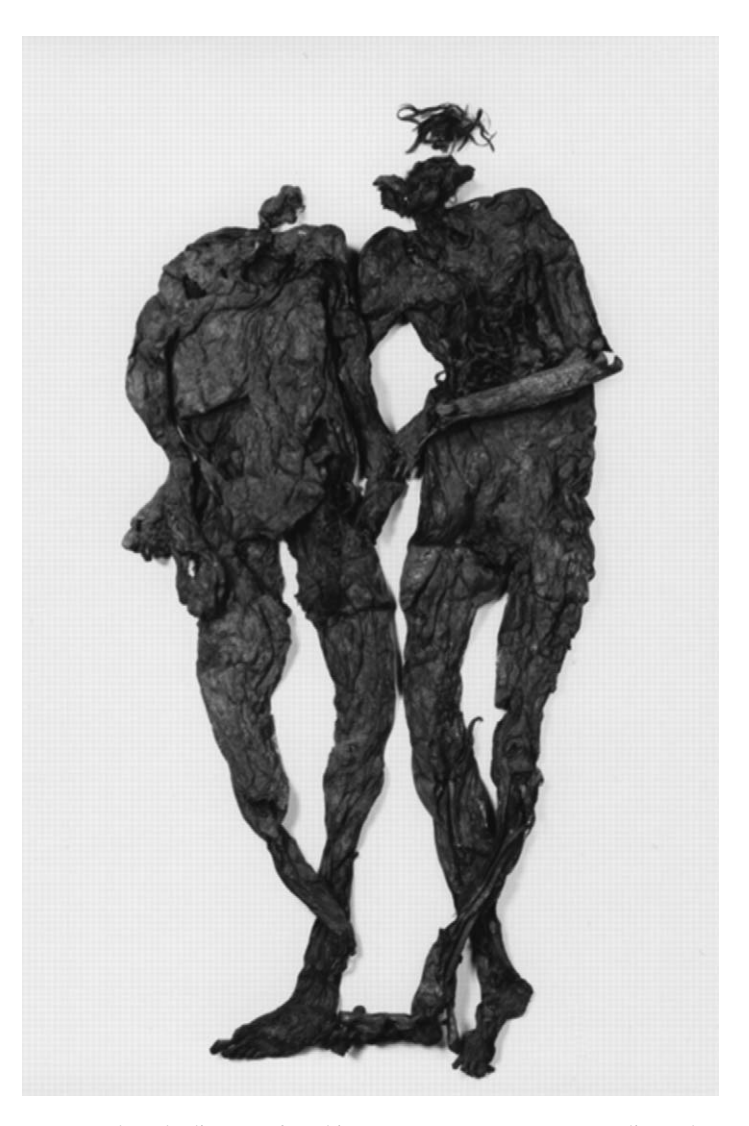
Fig. 1. The "Weerdinge Couple"—two men whose bodies were found in Bourtanger Moor near Weerdinge, the Netherlands, in 1904. The men died approximately 2000 years ago. Drents Museum, Assen.

in 1952 [33]. It was another 20 years before the next two bodies, of Tollund Man and Elling Woman, were to be radiocarbon dated [34]. Until the discovery of Lindow Man, in 1984, radiocarbon analysis was not considered an ideal means for dating bog bodies. This is understandable, because a substantial amount of bone or skin was needed for conventional radiocarbon dating, and museum curators were of course reluctant to sacrifice the necessary samples. Moreover, bog bodies were not a 'hot issue' in those days.