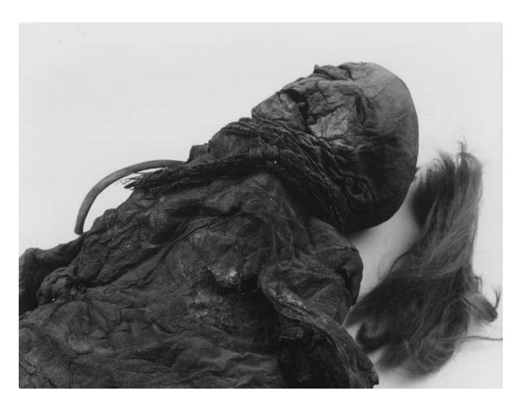
Fig. 2. "Yde girl", the body of a strangled 16-year-old girl found near Yde, the Netherlands, in 1897. Note the cord used to strangle the girl visible around her neck. Drents Museum, Assen.

is consistent with our measurements. Bone from the body (KIA-15123) yielded a younger date. An associated wood sample (KIA-15911) yielded a date in the Bronze Age, which is of course too old.