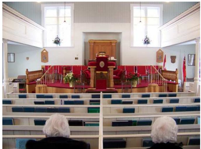
Right: Sanctuary of St. Paul's Presbyterian Church, Glencoe, Pictou County, NS.