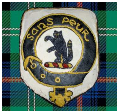
Above: Finished product Shown is a Clan Sutherland cake.