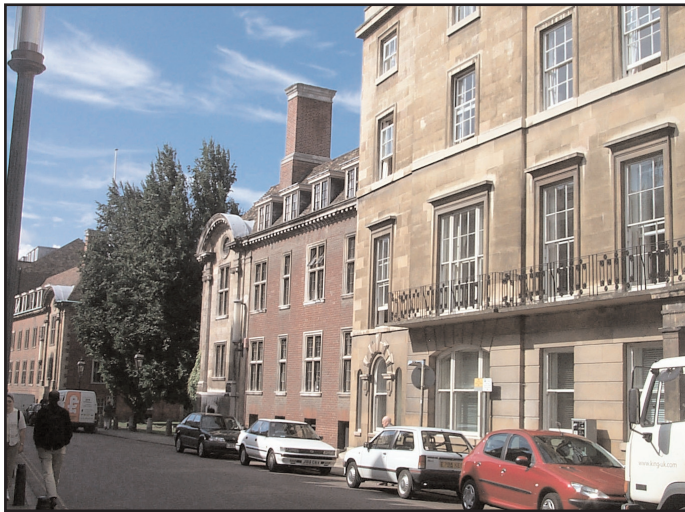
St. Catharine's College and the former Bull Hotel

Inside the King's Ditch was St. Botolph's, a dedication often located close to town gates. It was in place by the 12th century and its origins may well be earlier. St. Mary the Less was originally called St. Peter without Trumpington Gate. This of probable pre-Conquest date as there fragments of Anglo-Saxon interlace surviving in the church. Religious houses included the Friars of the Sack near the Fitzwilliam Museum site and the Gilbertines on the site of Old Addenbrooke's. The street marks the western boundaries of Pembroke and Corpus Christi Colleges, although in the medieval period the latter was set back from the street line. From the King's Ditch the road runs out into an early suburb of Cambridge and on out into the rural hinterland.