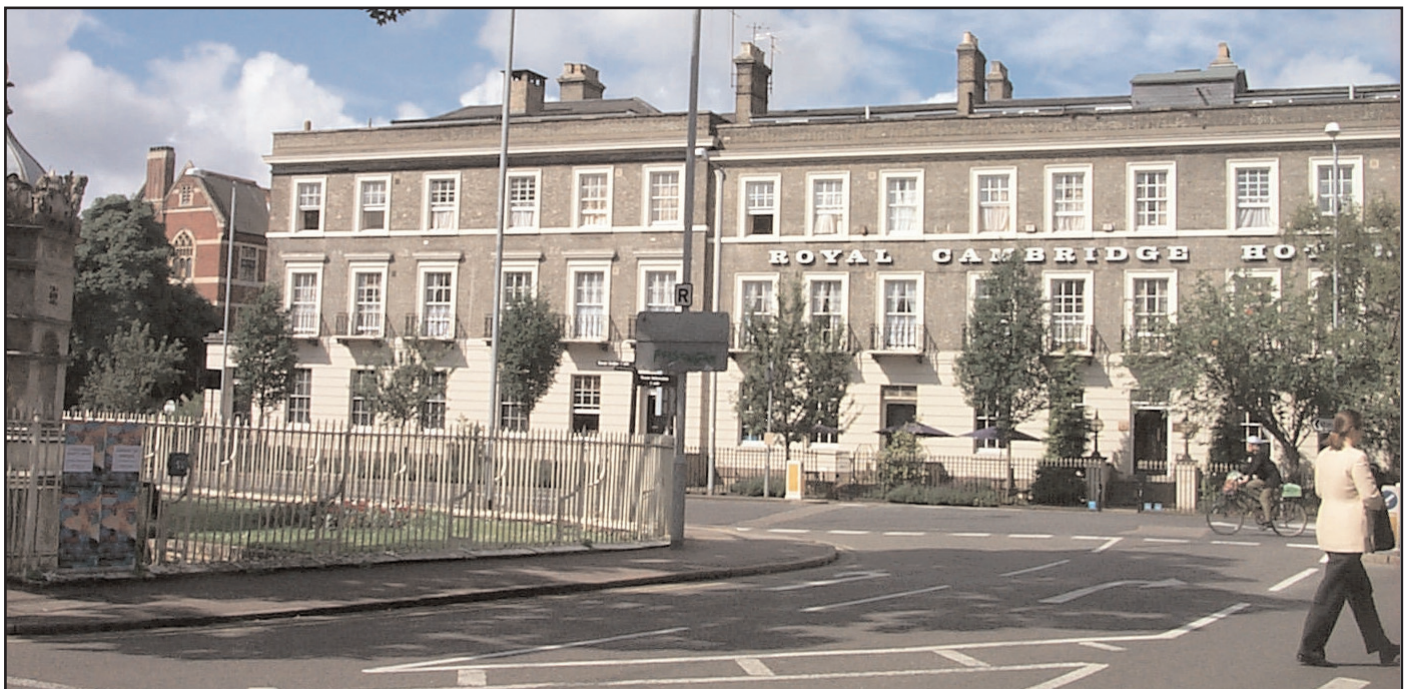
The Royal Cambridge Hotel