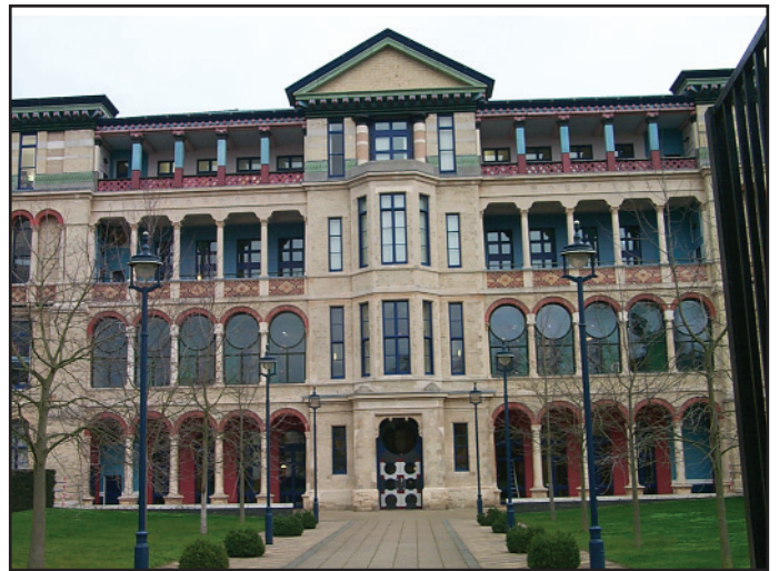
The Judge Institute