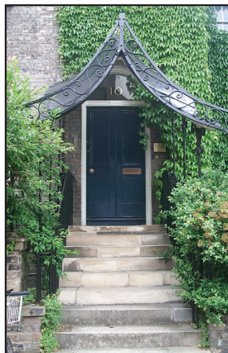
Canopy to no 10 Fitzwilliam Street