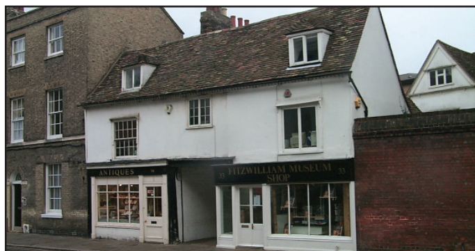
Fitzwilliam Museum shop

The hard space in front of no 74 is wasted and could be enhanced to create a better entrance to the building.