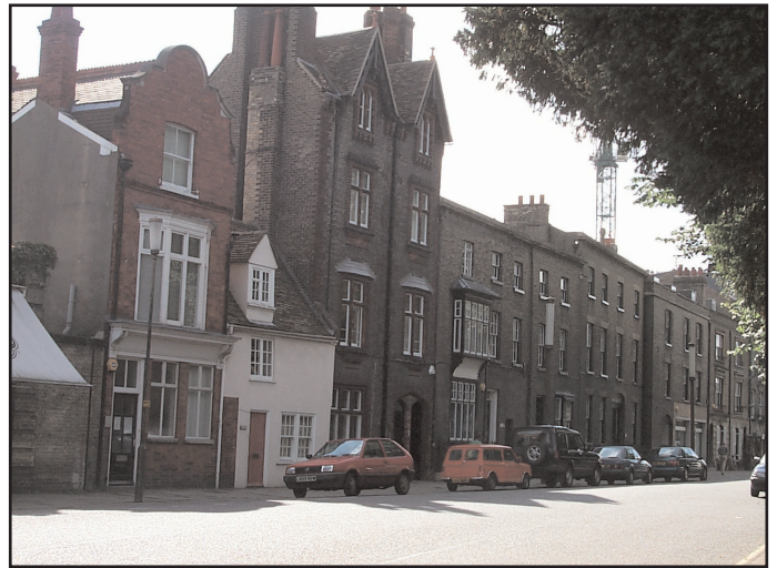
East side of Trumpington Street viewed from the North