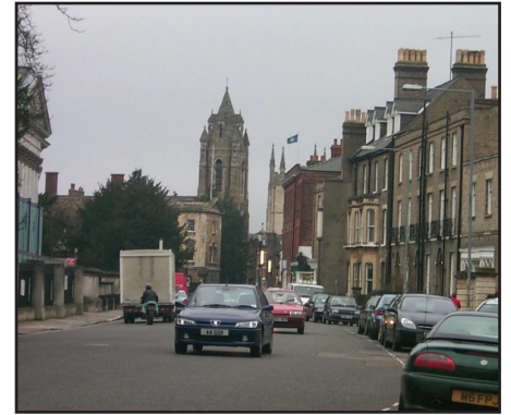
View along Trumpington Street

and has subsequently been followed by St Catharine's, Pembroke and Corpus Christi colleges, all of which have entrances off the street. It is a long sweeping street lined by many grand historic buildings.