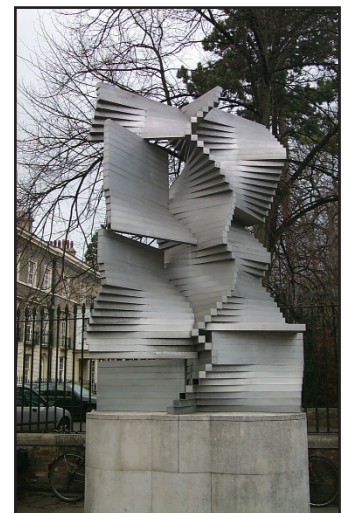
Public art outside Scroope Terrace