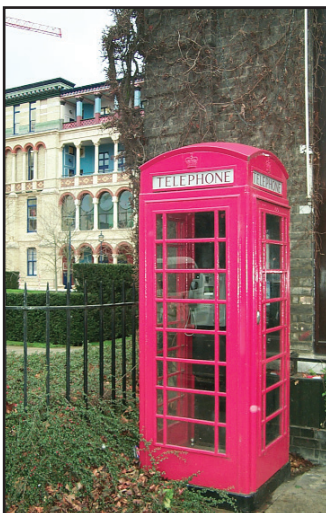
Grade II Listed telephone kiosk