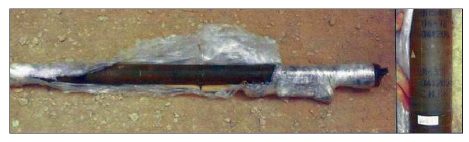
SA-7b missile recovered from an arms cache in Iraq, September 2008. Markings on the launch tube indicate that it was manufactured in 1978.

Recent advances in MANPADS technology have increased their range, speed, and target sets. New motors, for example, have extended the ranges of systems such as the