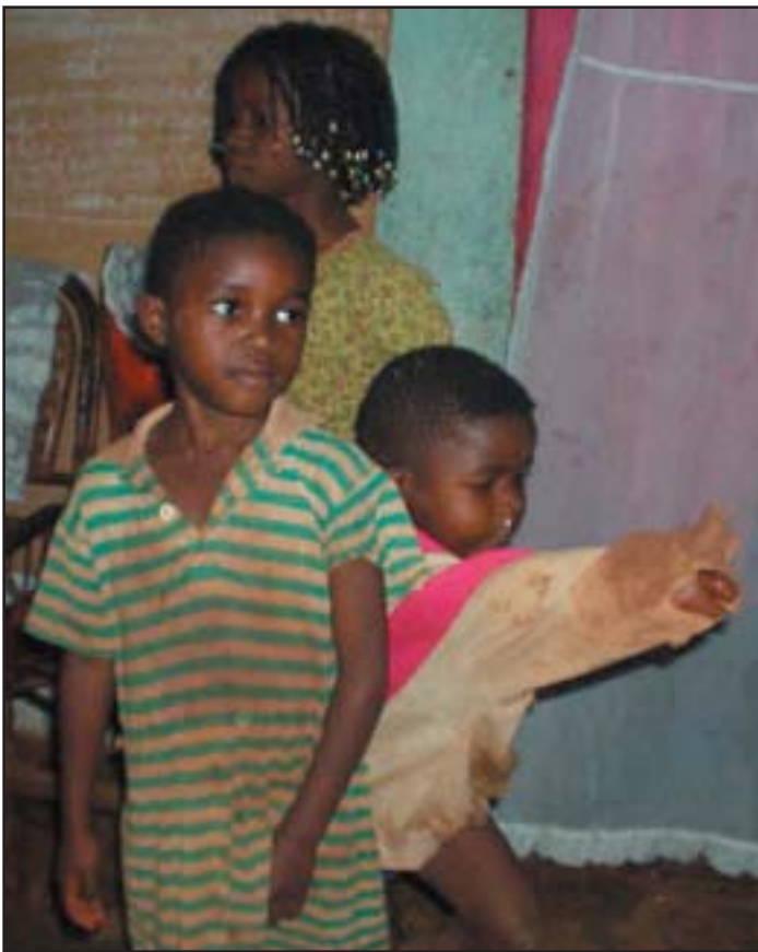
Yemele children before and after receiving their Christmas clothes. Dschang, West Province, Cameroon.