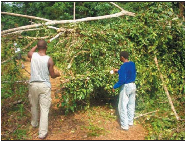
Clearing the road on the way to Campo-Ma'an National Park, South Province, Cameroon. The National Park is located near Kribi on the map.