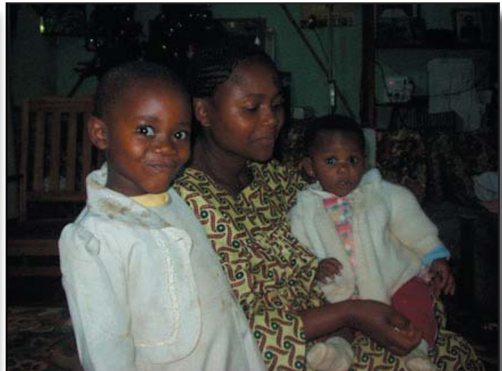
Nnane children in Dschang, West Province, Cameroon on Christmas.