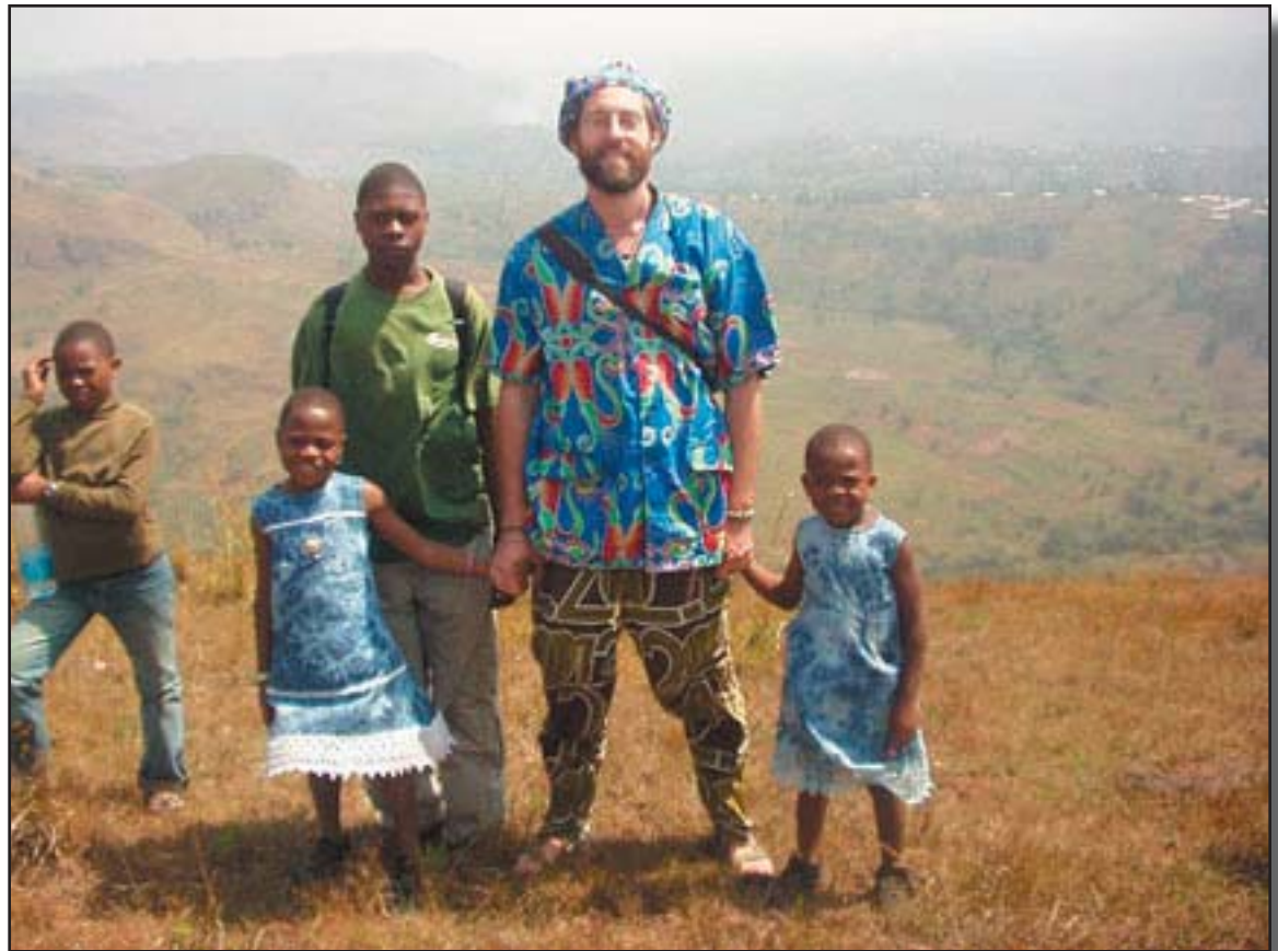
Fongo Tongo. Tsamo children on one of the Bambou- tos mountains.