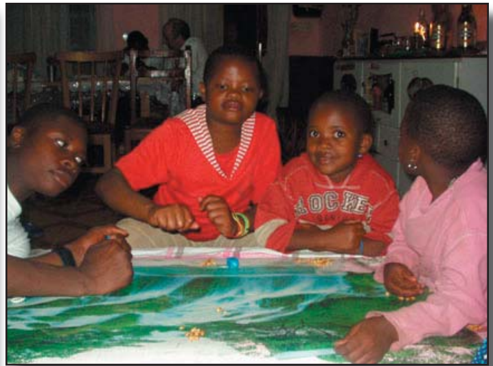
Playing Dreidel with the Tsamo children in Dschang, West Province, Cameroon. Western Cameroon is located near Bafoussam on the map. It is the capital of the West Province.