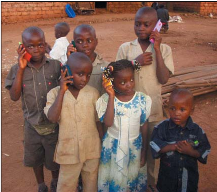
Children at the Chief's palace pose with their plastic cell phone Christmas presents.