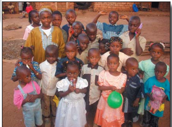
The children of the Chief of Keleng in Foto, West Province, Cameroon wearing new clothes from Colorado.

Cameroon is slightly larger than the state of California and is located in Western Africa. The population is 16,380,005, a number which explicitly takes into account the effects of excess mortality due to AIDS; this can result in lower life expectancy, higher infant mortality and death rates, lower population and growth rates, and changes in the distribution of population by age and sex than would otherwise be expected