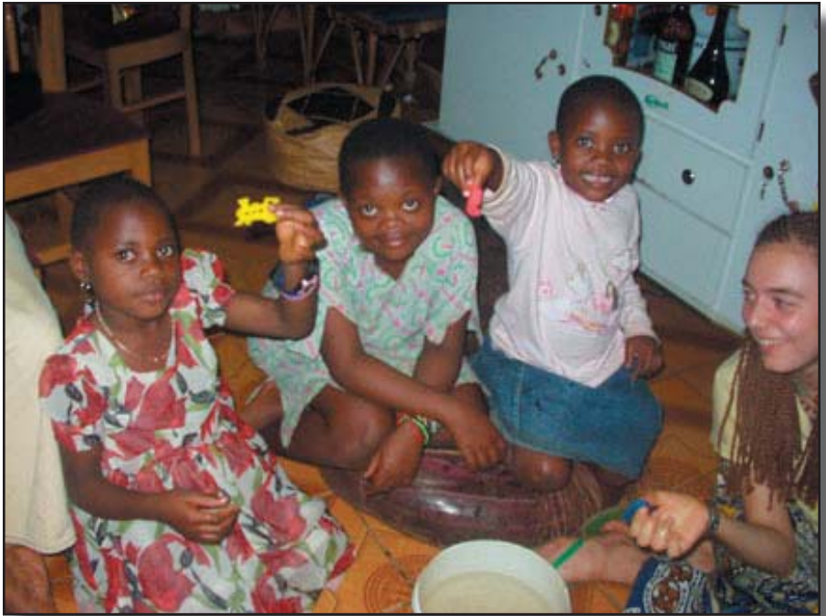
Tsamo children playing with their Christmas presents, sponge toys that grow in water.