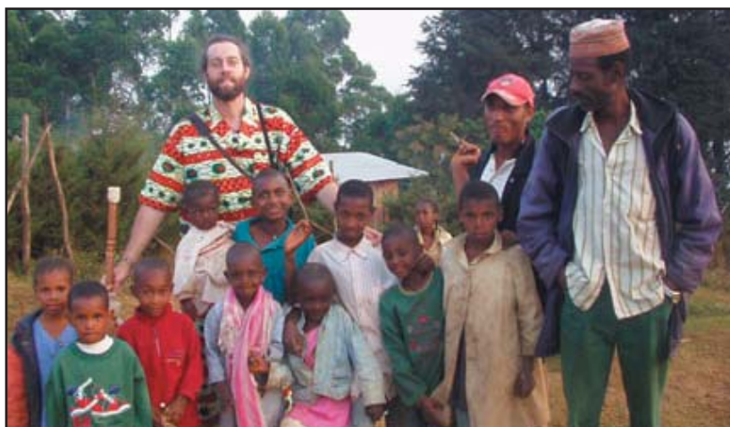
Sabga, Northwest Province, Cameroon. They are semi-nomadic, cattle herding people (Fulani). Sabga is located near Bamenda (see map) and is the capital of the Northwest Province.