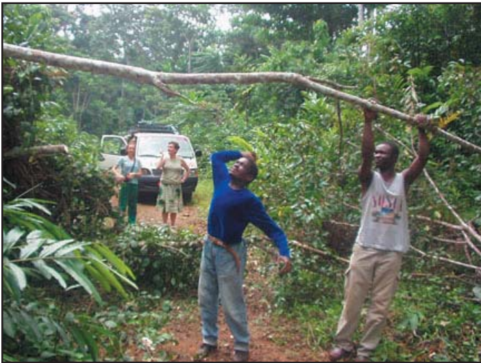
Typical roads in the rainforest region. Progress is made at the rate of about 10K per hour.