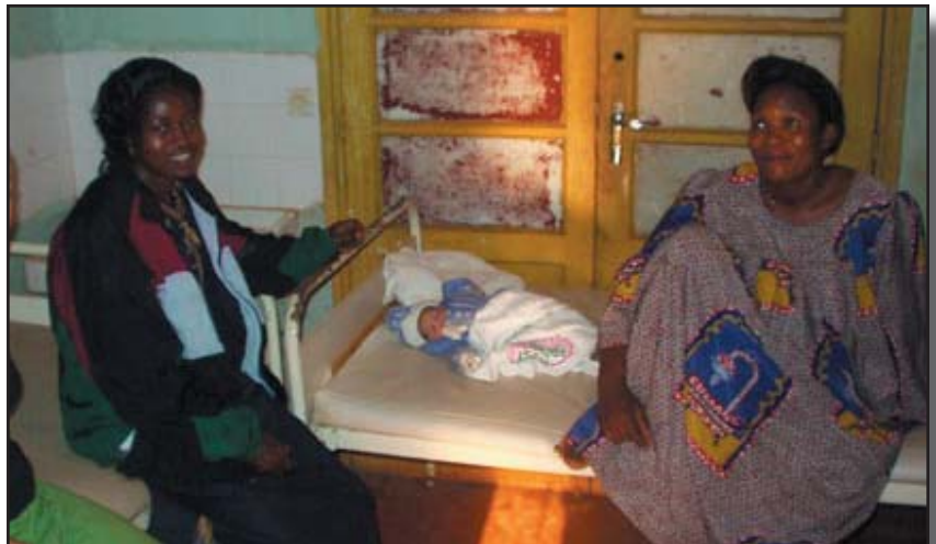
This hours-old newborn baby lies on a bed in a hospital in Dschang next to her mother.