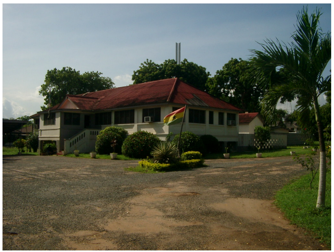
Ministry of Women and Children, Accra, Ghana