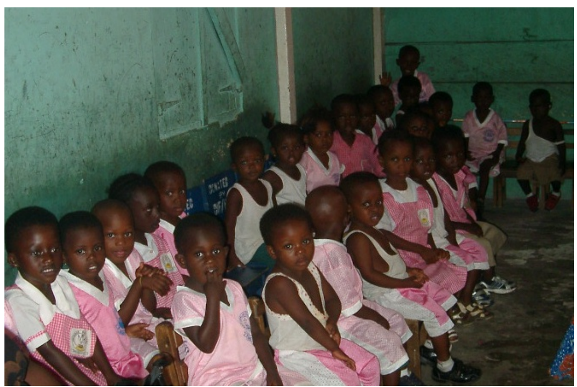
IDIF's Patience Daycare