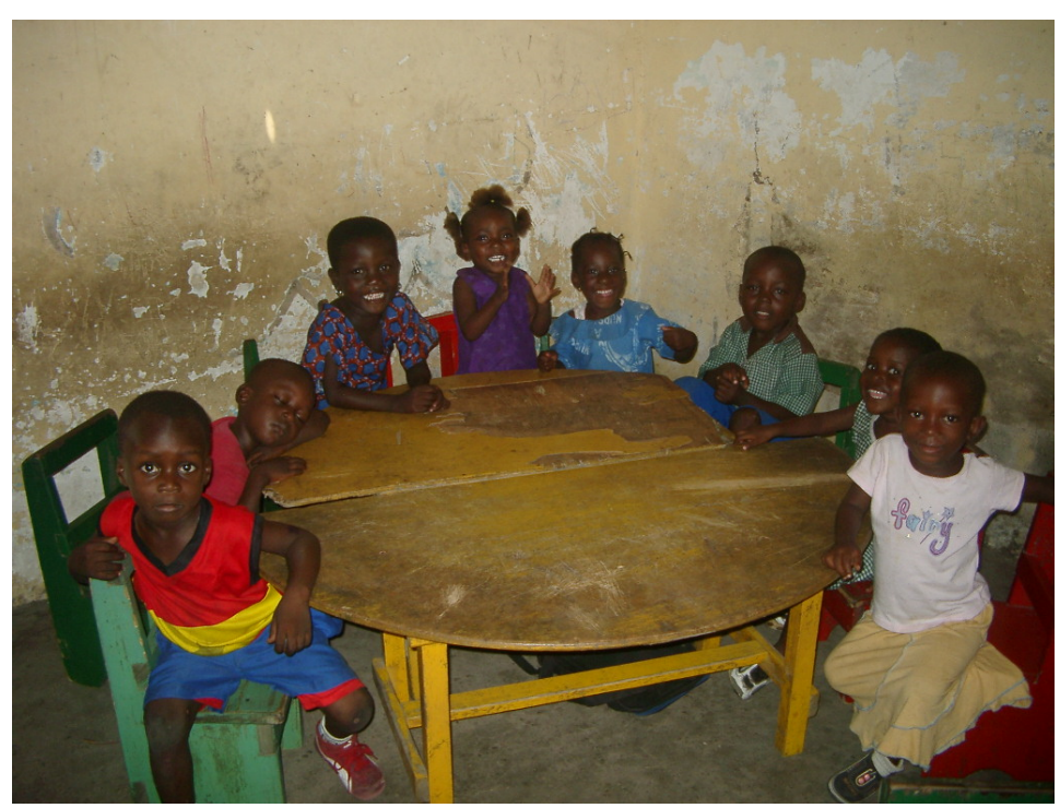
YPEP's Daycare Center in Chorkor

Submitted in partial fulfillment of the requirements of the degree of Master of Arts in International Educational Development at Teachers College, Columbia University