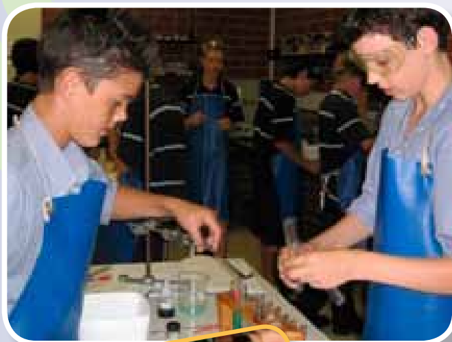
Junior Science at Work

Any Year 9 student about to enter Year 10 in 2011 is welcome to attend any one of the programs. For further details go to : http://www.scienceexperience.com.au/about