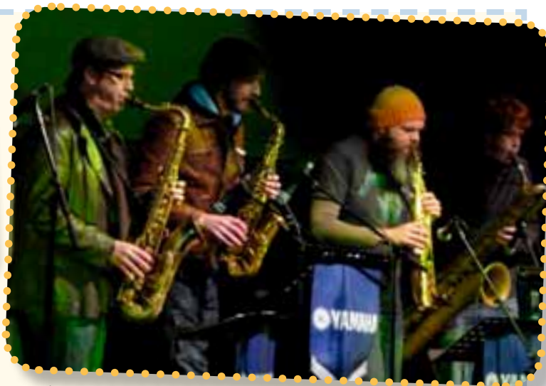
Adelaide's Sax Pack