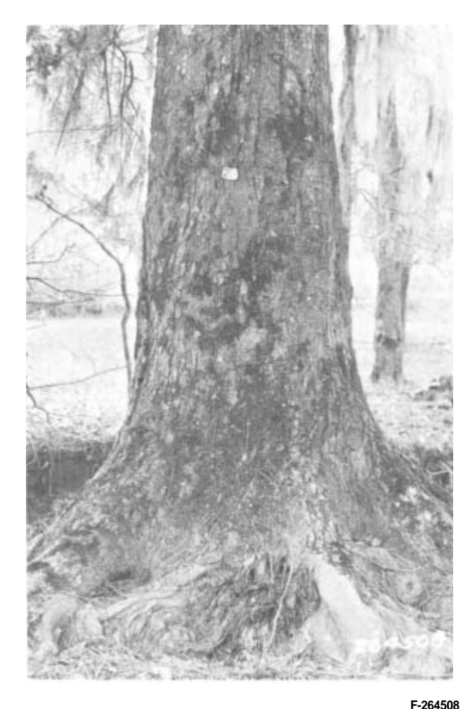
Figure 3.–Bark of southern magnolia.

The flowers of the magnolias are white, numerous, and very attractive. Southern magnolia blossoms are the largest, 6 to 9 inches across, as compared to 2 to 3 inches across for sweetbay blossoms, which, however, have the sweetest odor. The fruit is an ovoid to cylindric cone, rose-colored, and 3 to 4 inches long by 1\frac{1}{2} to 2 inches in diameter for southern magnolia; and dark red, 2 inches long and \frac{1}{2} inch in diameter for sweetbay. On opening, the flattened, obovoid, \frac{1}{4} to \frac{1}{2}