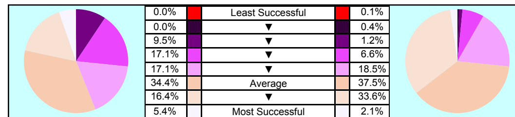
The pie charts represent the weighted proportions of individual indicators falling into each band

60% of households are renting a private landlord. Terraced housing accounts for over 70% of the stock. 48% of properties are classified in Council Tax Band A and 35% in Band B.