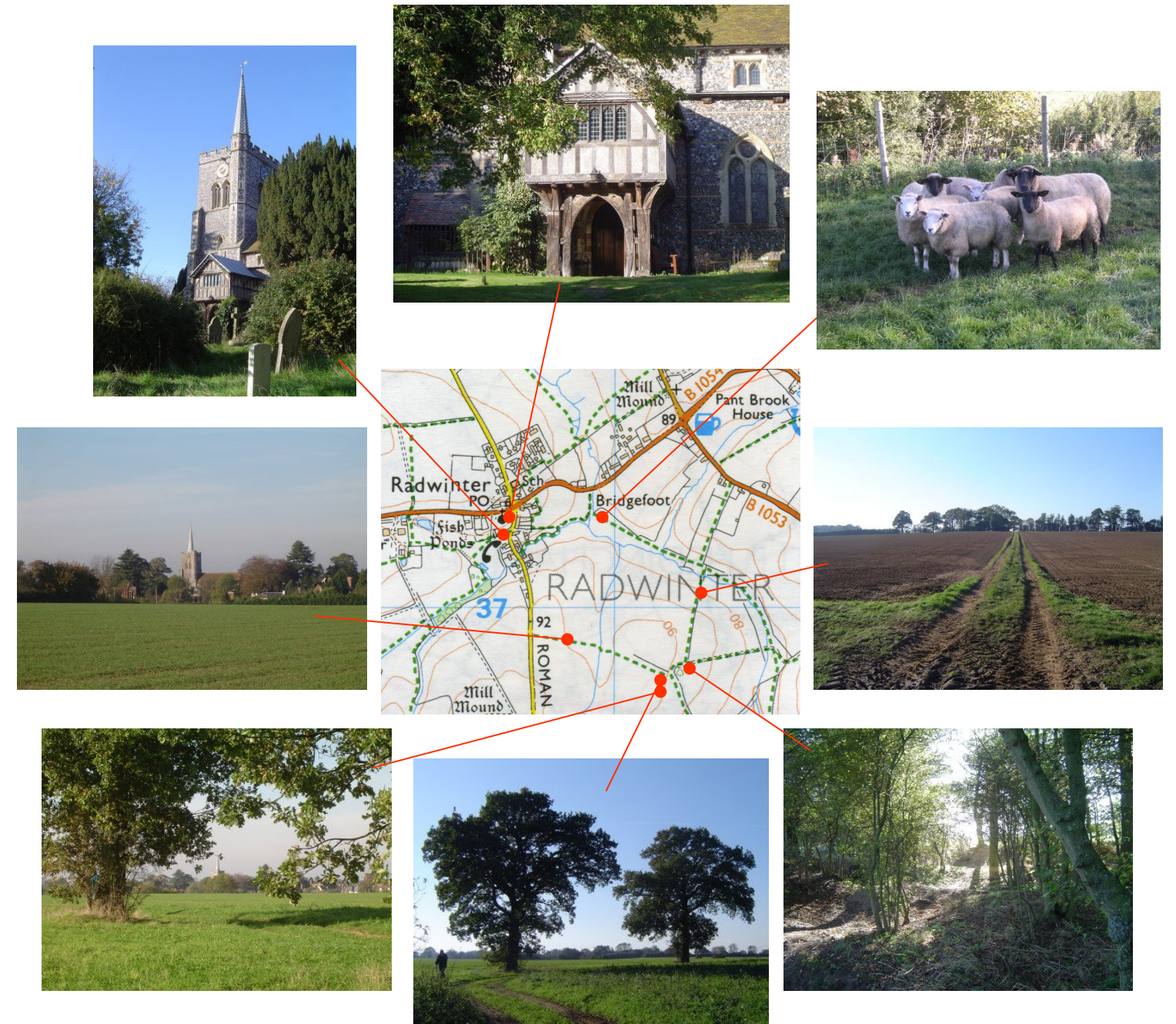
Maps reproduced from Ordnance Survey Mapping with the permission of the Controller of Her Majesty's Stationery Office. Crown Copyright.