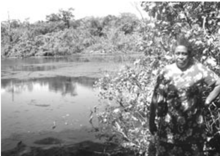
Below: A Falealupo villager at the wetlands to be protected in exchange for Seacology's funding the restoration of Falealupo's historic white sand beach.

In early July 2006, a group of Seacology's dedicated Japanese fellows and board members traveled to the South Pacific island nations of Samoa and American Samoa. The group was greeted warmly at Falealupo Village, home to Seacology's founding project, the Falealupo Rainforest School and canopy walkway. The group also viewed Seacology's newest project in Falealupo, the restoration of a historic white sand beach in exchange for the protection of a wetland that is critical habitat to several threatened wildfowl species. Expedition members also experienced the thrill of climbing the tower and walking across the rainforest canopy walkway.