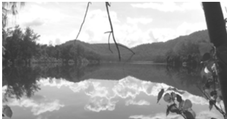
The Wakon, Vanuatu Sea Lake.

MALDIVES, Ra Maakurathu Island - Establish a waste management system in return for a total ban on using coral for any building purpose and extracting sand for any purpose, and a ban on harvesting turtle eggs for consumption for a duration of 10 years. *