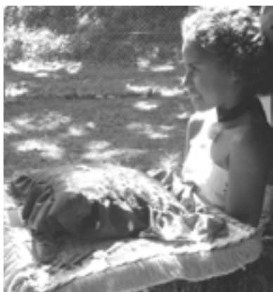
A young girl from Vuna Village, Fiji readies for the opening of the village's new community center.

Seacology established the Island Legacy Society to honor those that have included Seacology in their estate plans. The Society was created to ensure that coral reefs, tropical rainforests and island cultures are here for future generations. You can make a contribution in any amount in any of the following ways: bequest in your will; gift of real estate, securities or other property; charitable trust; life insurance policy; retirement plan beneficiary designation; or in some other way you choose. Contact Susan Racanelli about the many ways that you can help (tel: 510-559-3505 or email: susan@seacology.org ).