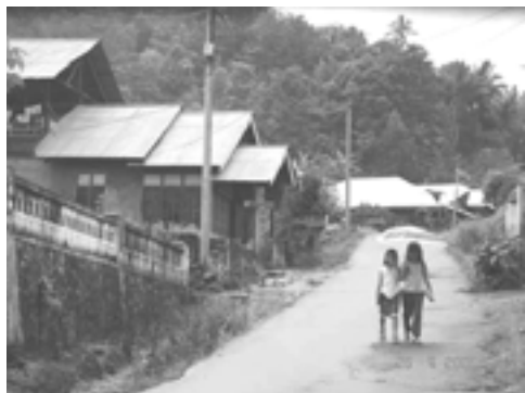
Girls walking to school in Tulaun, Indonesia.

MALDIVES, Innamadhoo Island - Establish a waste management system in return for a total ban on using coral or extracting sand for any building purpose; and a total ban on killing turtles or harvesting turtle eggs, harvesting sea cucumbers, shark fishing or shark finning for a duration of 10 years. *