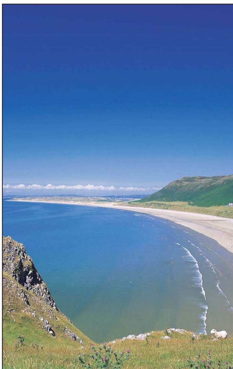
Rhossili, Huw Edwards' favourite Gower spot

Huw Edwards took over the 10 O'Clock news slot in 2002. He graduated into journalism by chance at Swansea Sound after gaining a first class honours degree in French.