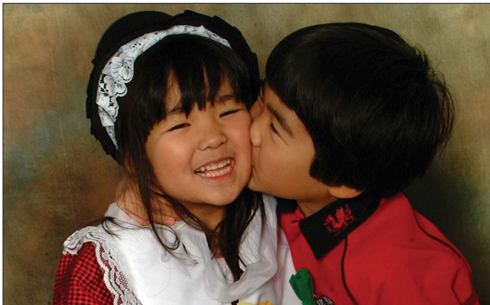
Hundreds of children helped celebrate Welsh culture at Swansea Market on St David's Day and many more are expected to join in the celebrations as the city hosts the National Eisteddfod this summer. Details on page 8