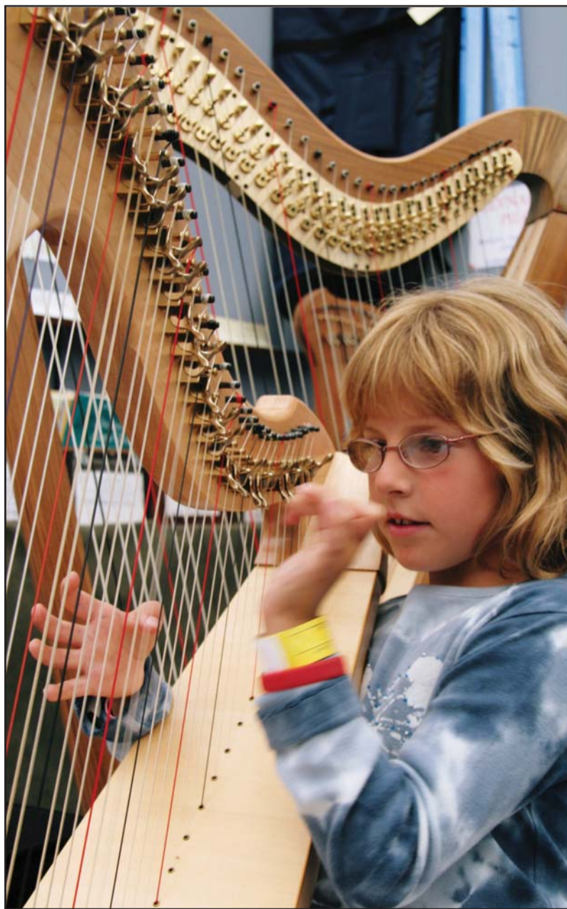
National Eisteddfod a highlight of the cultural summer