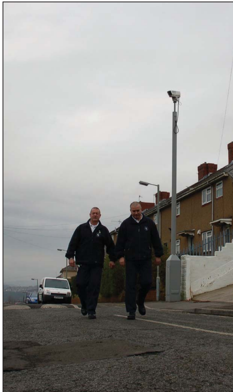
The NSU team out on patrol in Swansea