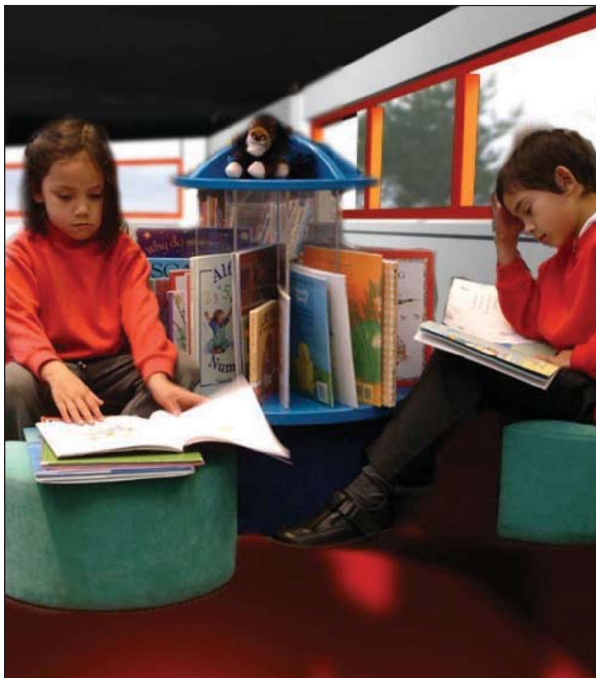
A graphic impression of how the new Civic Centre might look from the inside

single point of contact for a large number of council services. For example, visitors to the Civic Centre would be able to pay their Council Tax bill and book tickets at the Grand Theatre, he said.