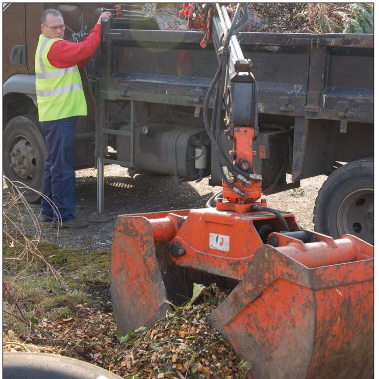
The Council's fly-tipping team clearing away more unsightly fly-tipped rubbish

"It will cost many millions of pounds but the Council wants a solution that is efficient, sustainable and gives Swansea the best value for money for the next 25 years."