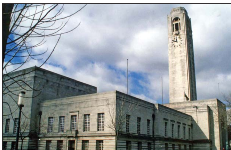
Guildhall will benefit from Capital Programme

"County Hall has always belonged to the people of Swansea. Now they are going to have the chance to use it as a lively centre of information, learning and culture."