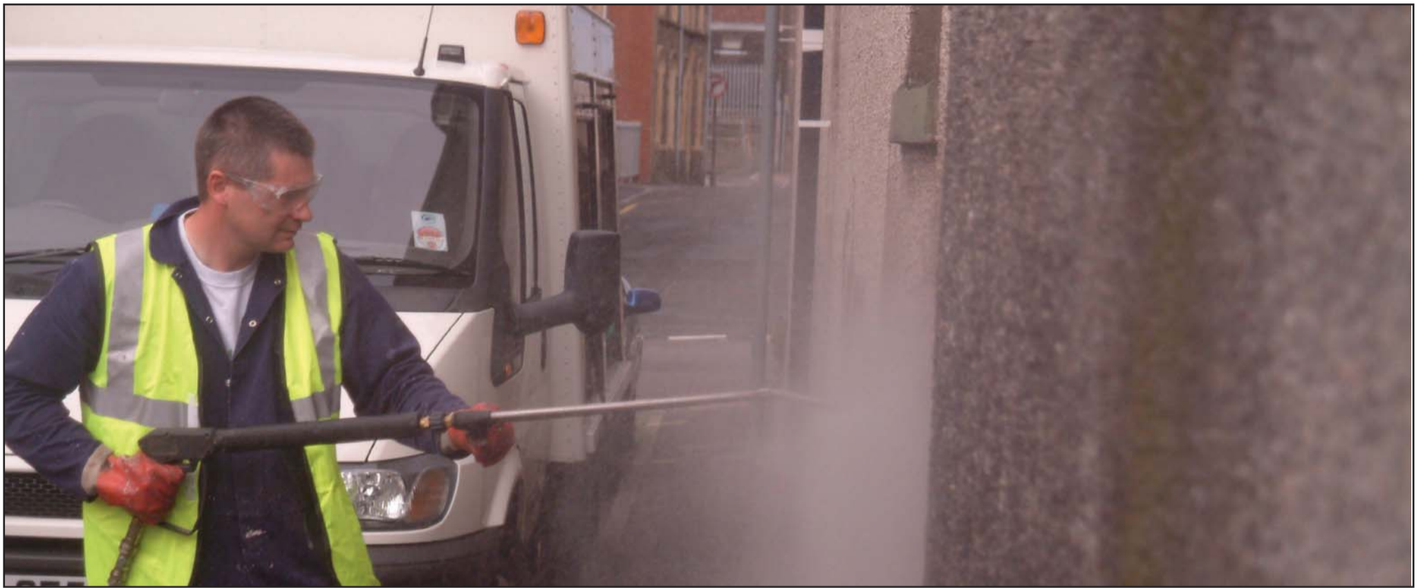
The Environment Department's graffiti team is on hand to go into action with power washers as quickly as possible after an incident is reported.