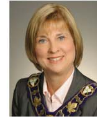
Mayor Virginia Hackson East Gwillimbury