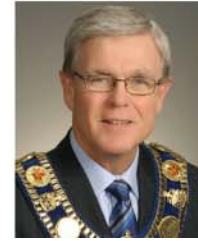
Mayor Geoffrey Dawe Aurora