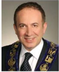
Mayor Maurizio Bevilacqua Vaughan