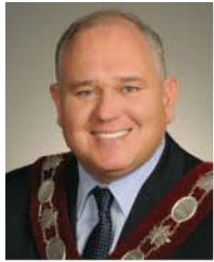
Mayor Frank Scarpitti Markham