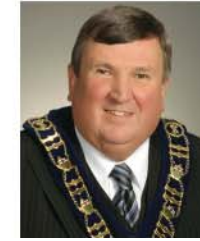
Mayor Wayne Emmerson Whitchurch-Stouffville